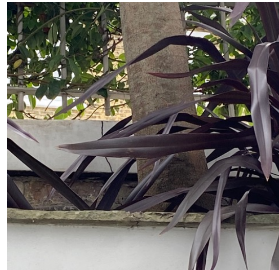
Cracking to front boundary wall and raised retainer due to limited rooting environment