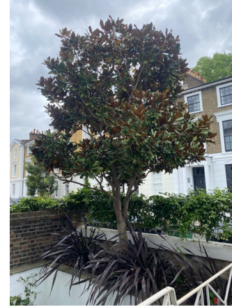
Tree T1 viewed to north east from front of property