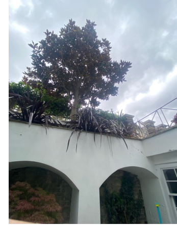
T1 sitting within limited 300mm width raised retainer