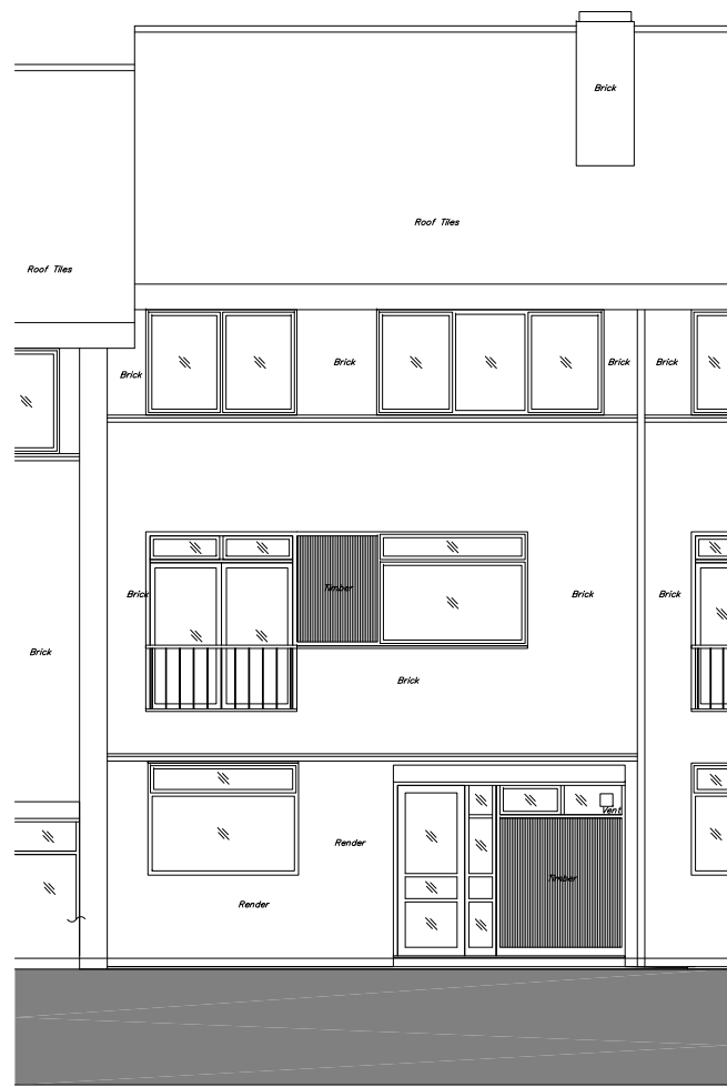
01 - Front Elevation - Existing