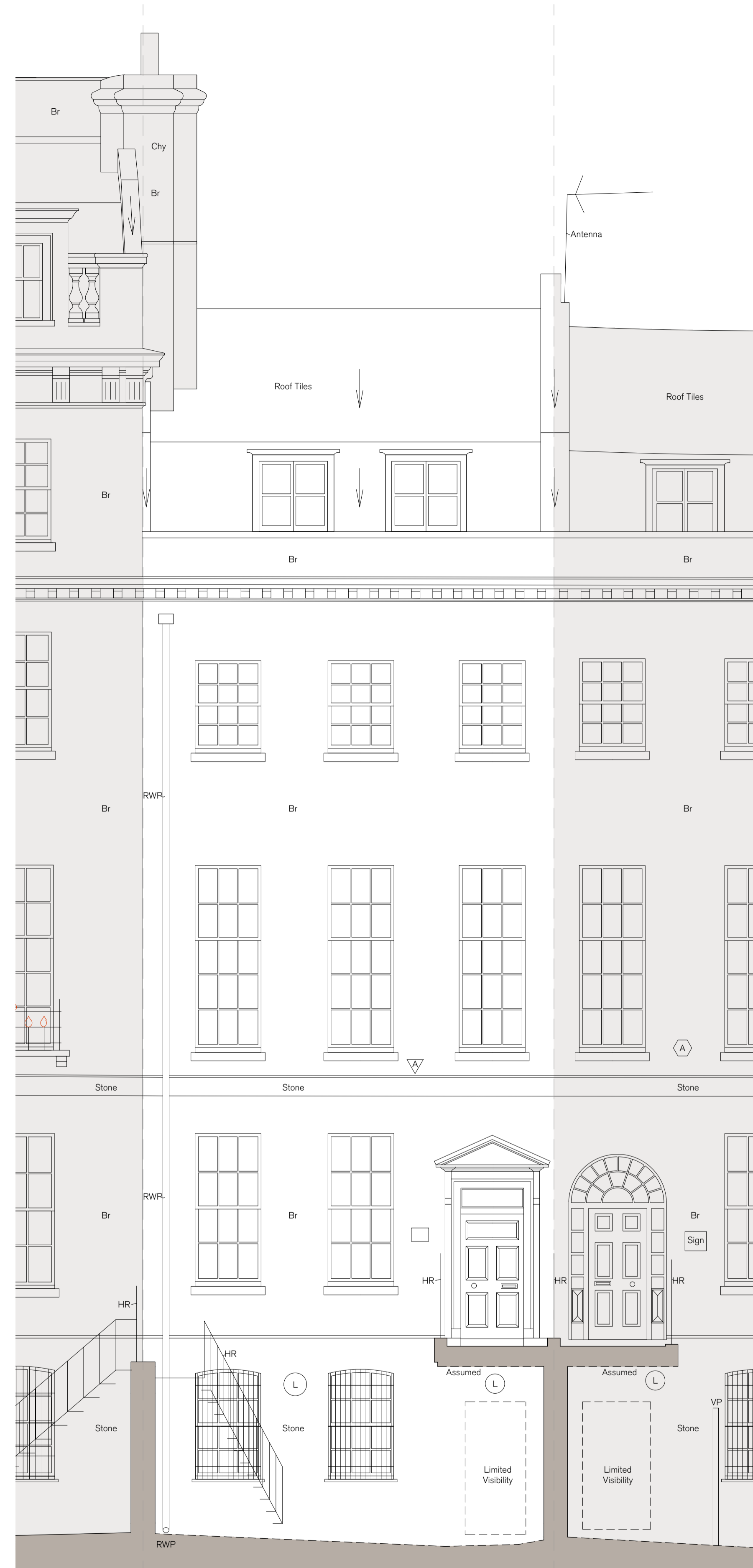
No. 1 Elevation A 1:50