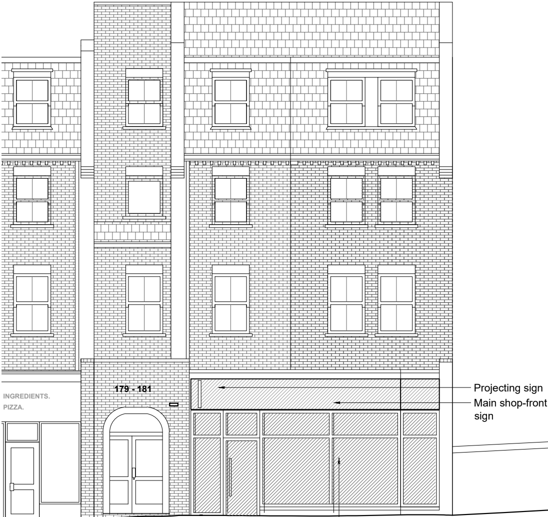
01 | EXISTING EAST ELEVATION 1:100

Refer to also drawing P627-P-005 Refer to dwg S-001 and S002 for location of existing AND PROPOSED AC unit.