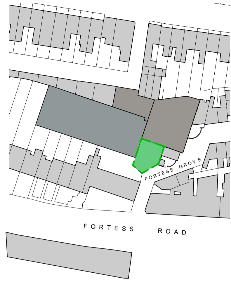
6 Location Plan Scale: 1:1000