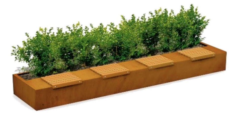
BE-01 Timber and corten bench seat with built-in planting (Similar to image)