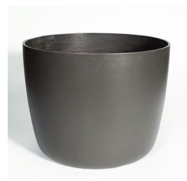
PL-03 Circular concrete planter