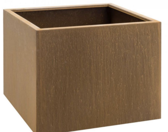
PL-02 Square corten planter