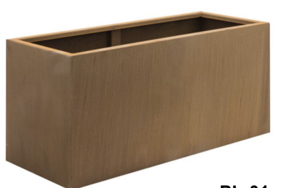
PL-01 Linear corten planter