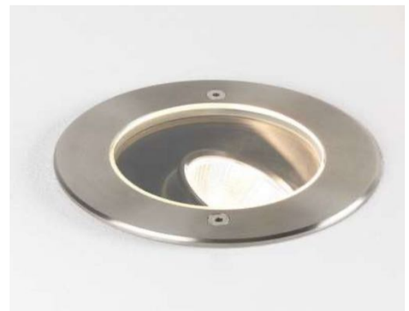
(K) In-ground light fitting