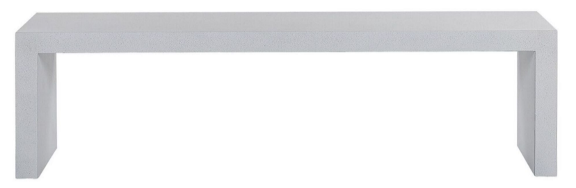
BE-02 Concrete bench seat