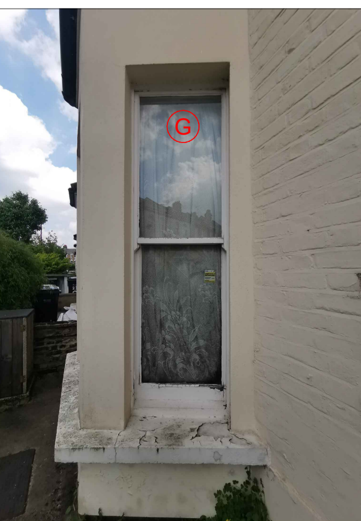
15 EXISTING FRONT ELEVATION 25 LOVERIDGE RD - PHOTO NOT TO SCALE