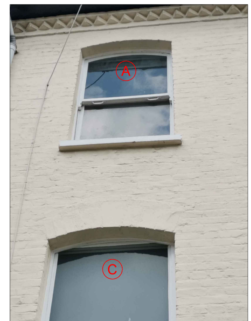
8 EXISTING FRONT ELEVATION 25 LOVERIDGE RD - PHOTO NOT TO SCALE