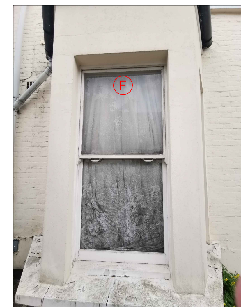
14 EXISTING FRONT ELEVATION 25 LOVERIDGE RD - PHOTO NOT TO SCALE