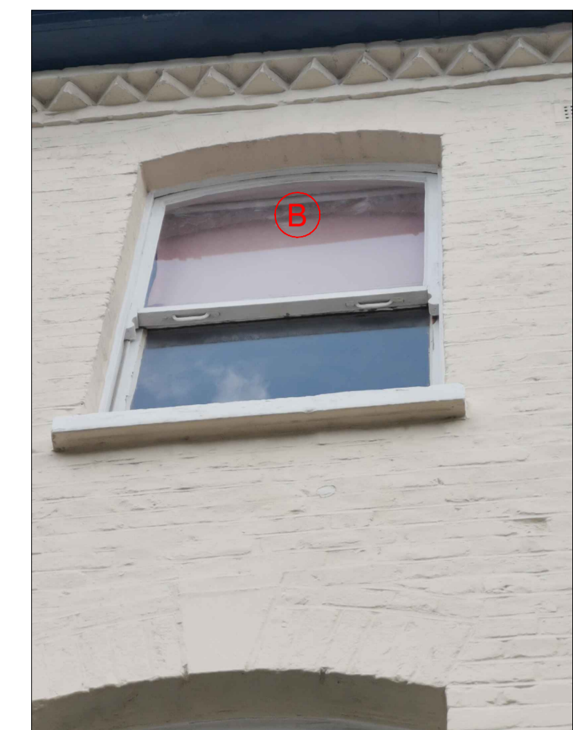
9 EXISTING FRONT ELEVATION 25 LOVERIDGE RD - PHOTO NOT TO SCALE