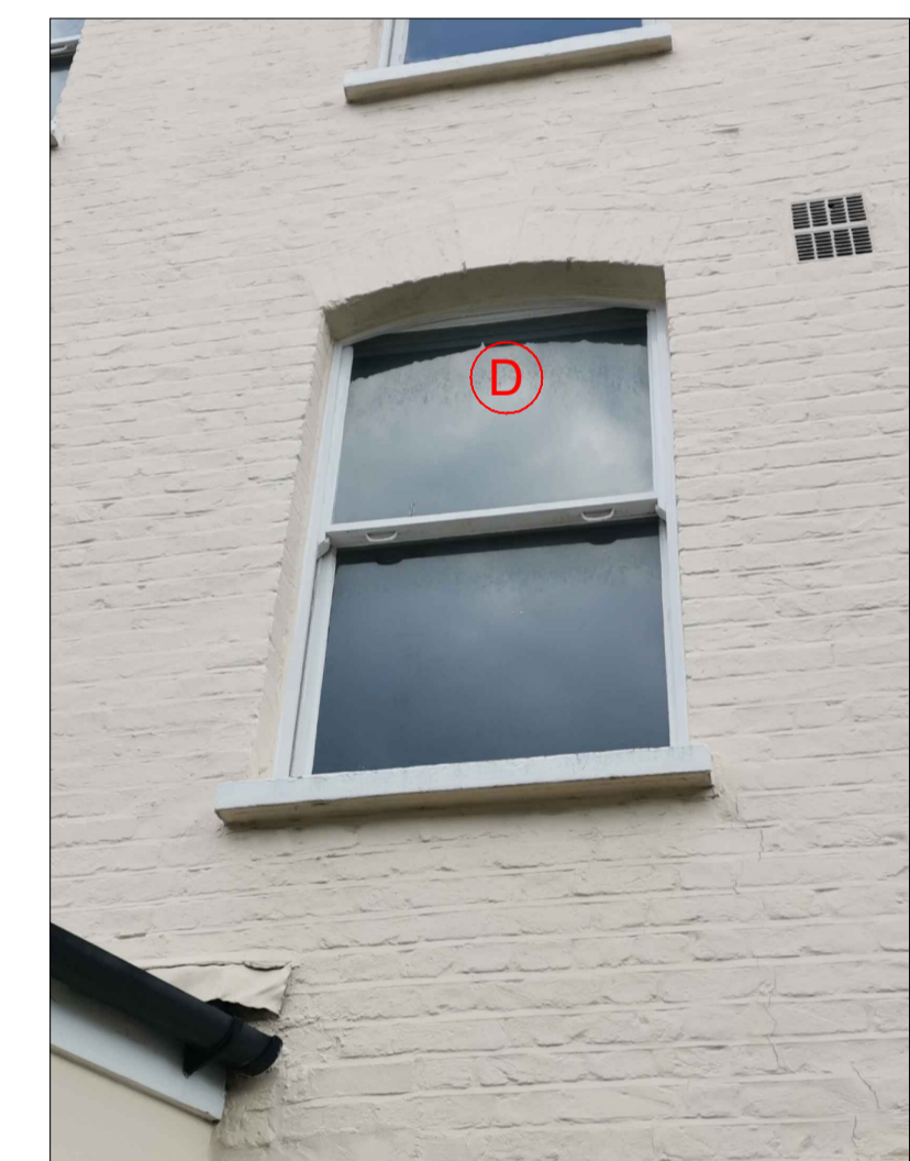
11 EXISTING FRONT ELEVATION 25 LOVERIDGE RD - PHOTO NOT TO SCALE