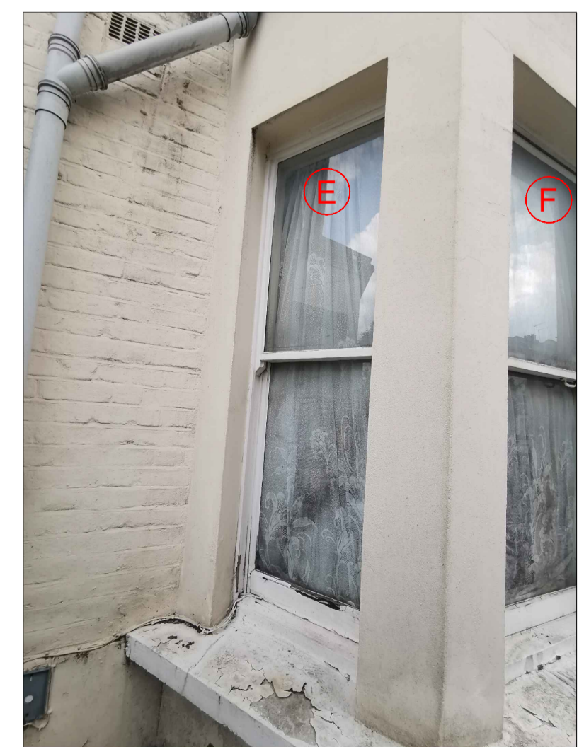
13 EXISTING FRONT ELEVATION 25 LOVERIDGE RD - PHOTO NOT TO SCALE