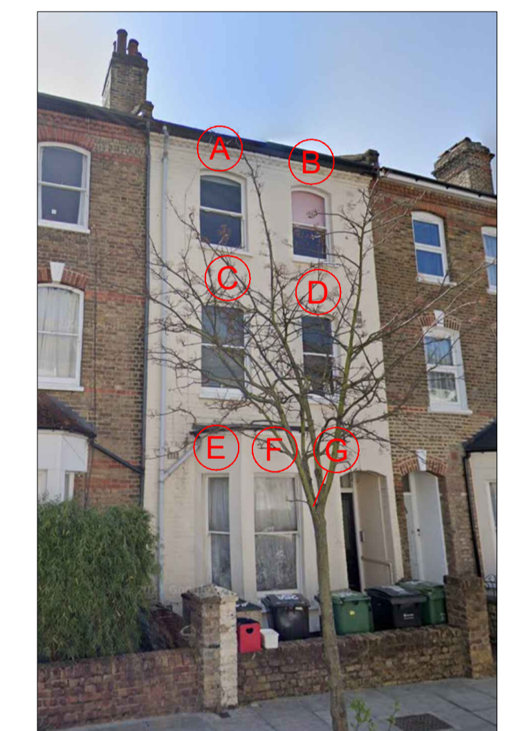
12 EXISTING FRONT ELEVATION 25 LOVERIDGE RD - PHOTO NOT TO SCALE