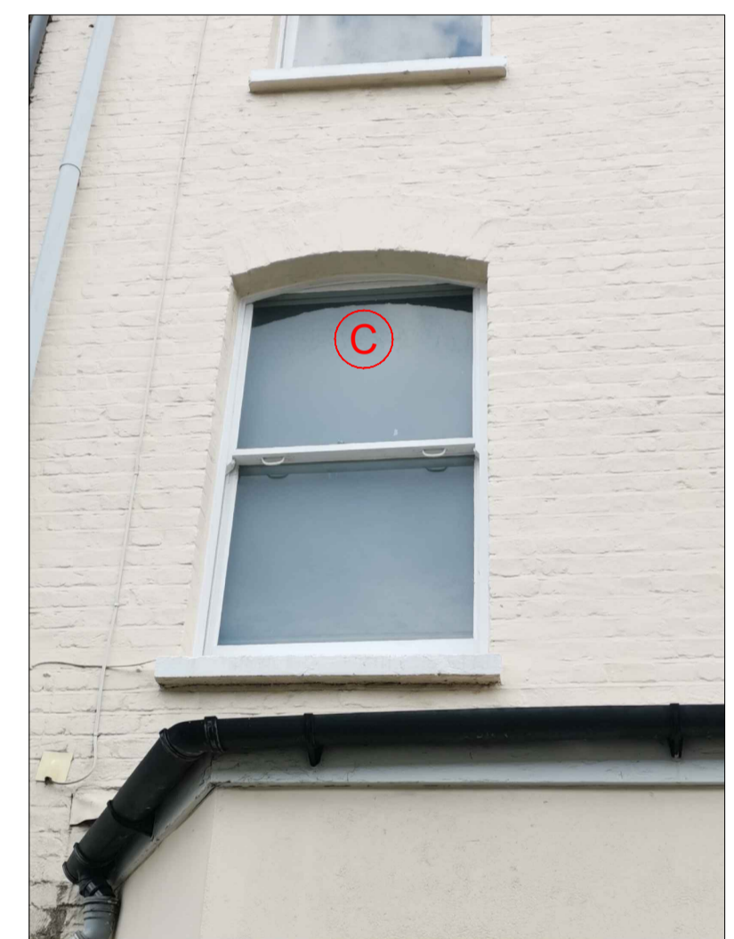
10 EXISTING FRONT ELEVATION 25 LOVERIDGE RD - PHOTO NOT TO SCALE