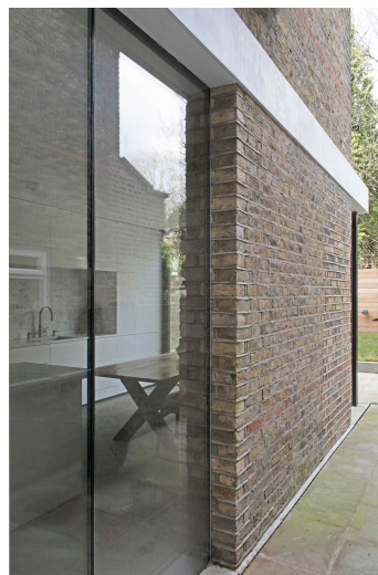
full-height sliding glazing white render

previous WILLIAM TOZER Associates examples :