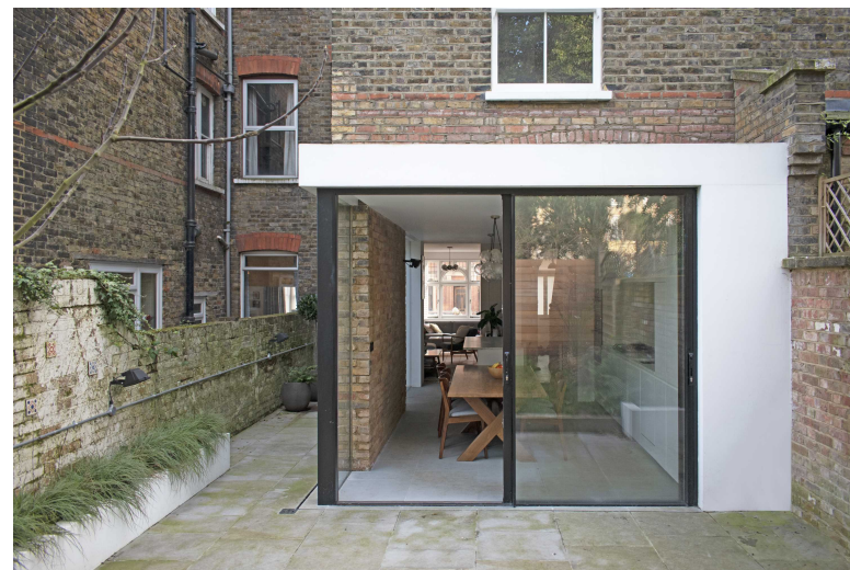
full-height sliding glazing with white render