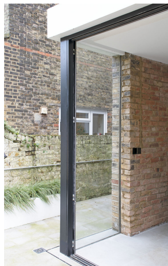
fixed and sliding corner glazing

previous WILLIAM TOZER Associates examples :