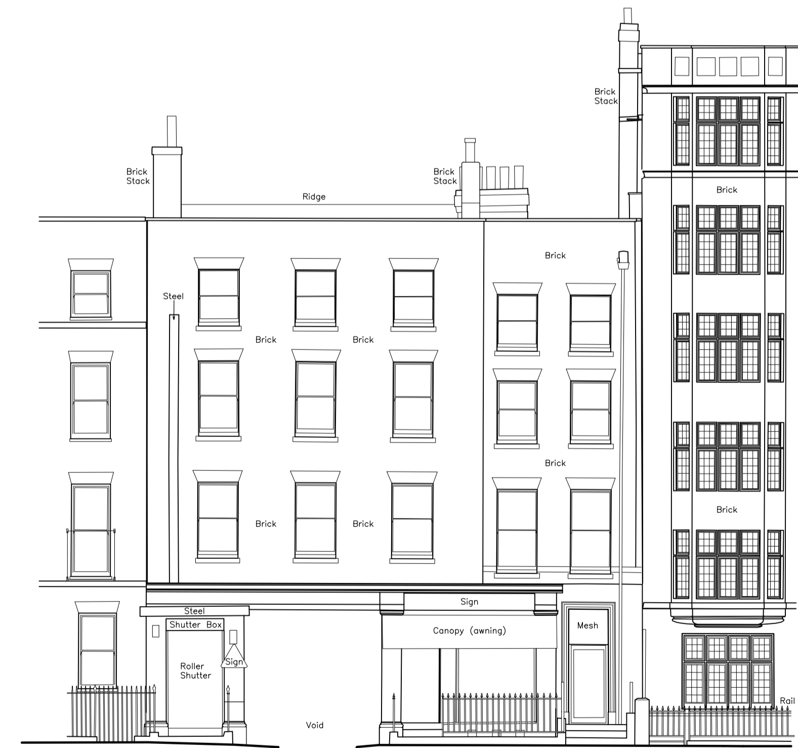
Existing Front (East) Elevation Scale 1:100

General Notes Local authorities (Planning Group or Building Control) might request for additional items / information to be added / revised. Contractor, sub-contractor or supplier is to report any errors, omission or discrepancies on the drawings, and shall not vary any work shown on the drawings without obtaining prior approval from the architect. Contractor, sub-contractor or supplier is responsible for requesting any additional information from the architect for the correct execution of the works. Contractor, sub-contractor or supplier shall supply to the architect all shop drawings, illustrations, specifications, etc. of all specialist work to be incorporated into the main contract works, and shall immediately inform the architect if any work shown on this drawing is not in accordance with the relevant codes of practice recognised as good practice throughout the industry or if it does not comply with the relevant local authority bye-laws or building regulations.