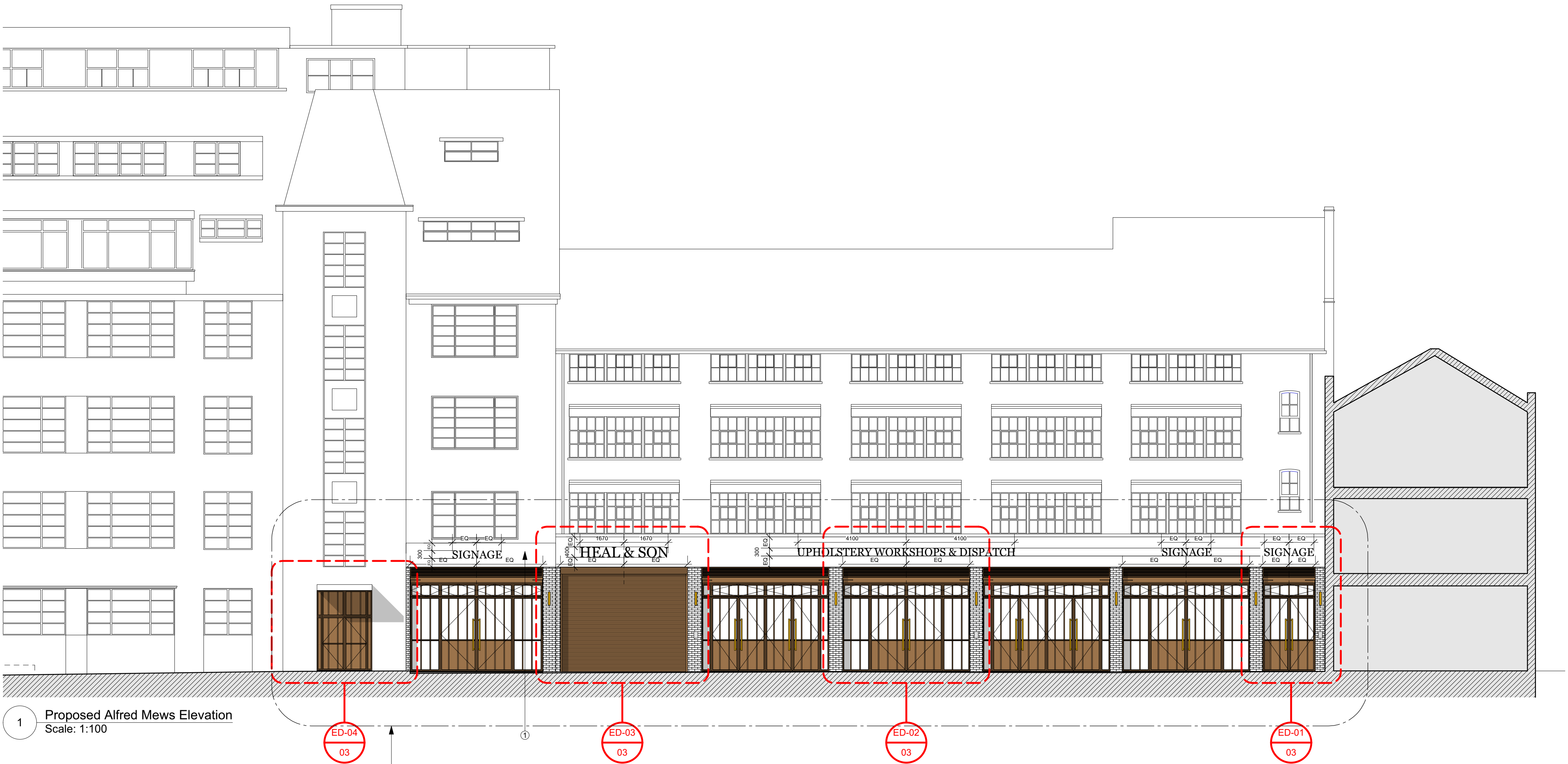
1 Proposed Alfred Mews Elevation Scale: 1:100