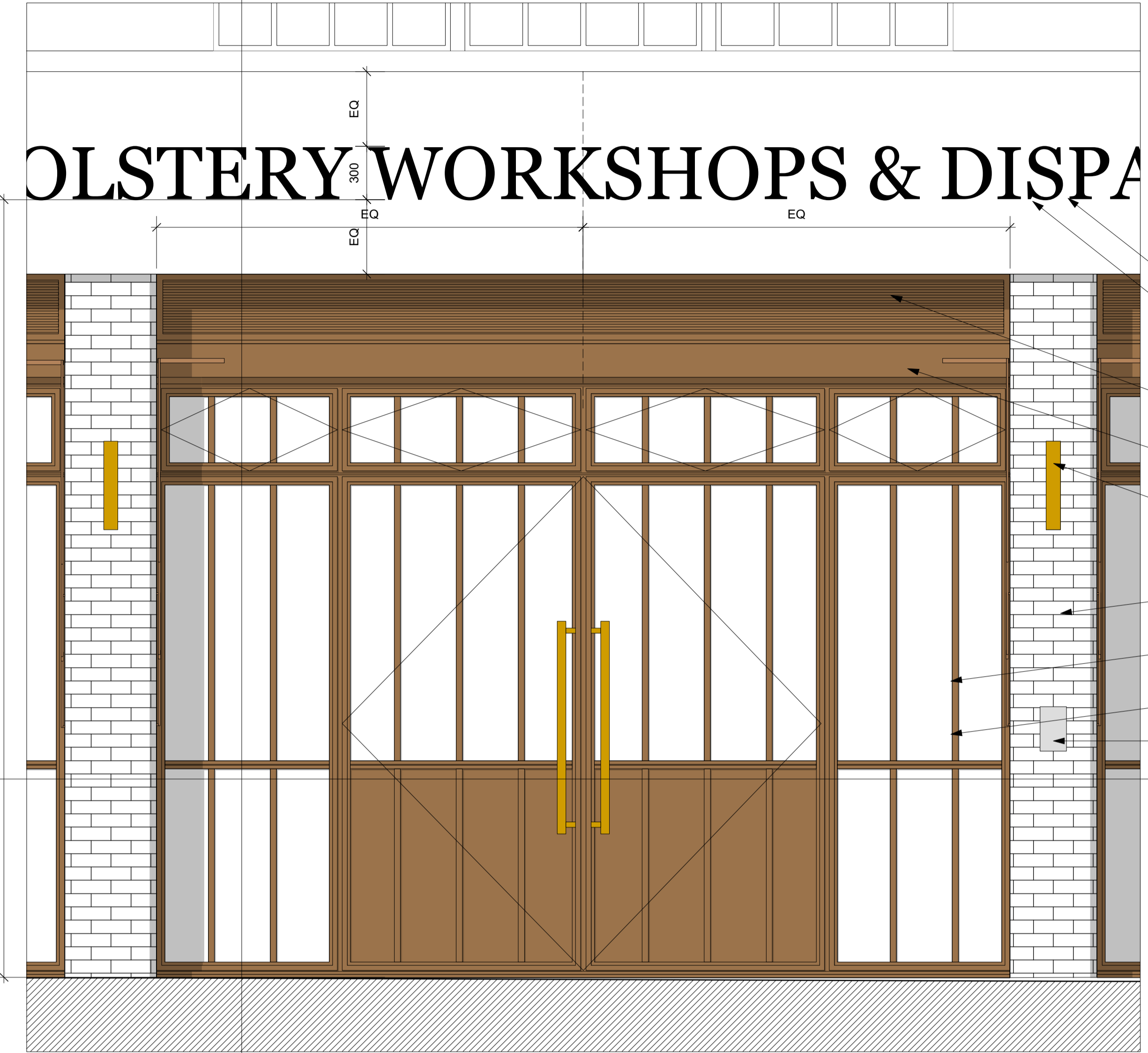
02 Alfred Mews Elevation Scale: 1:20