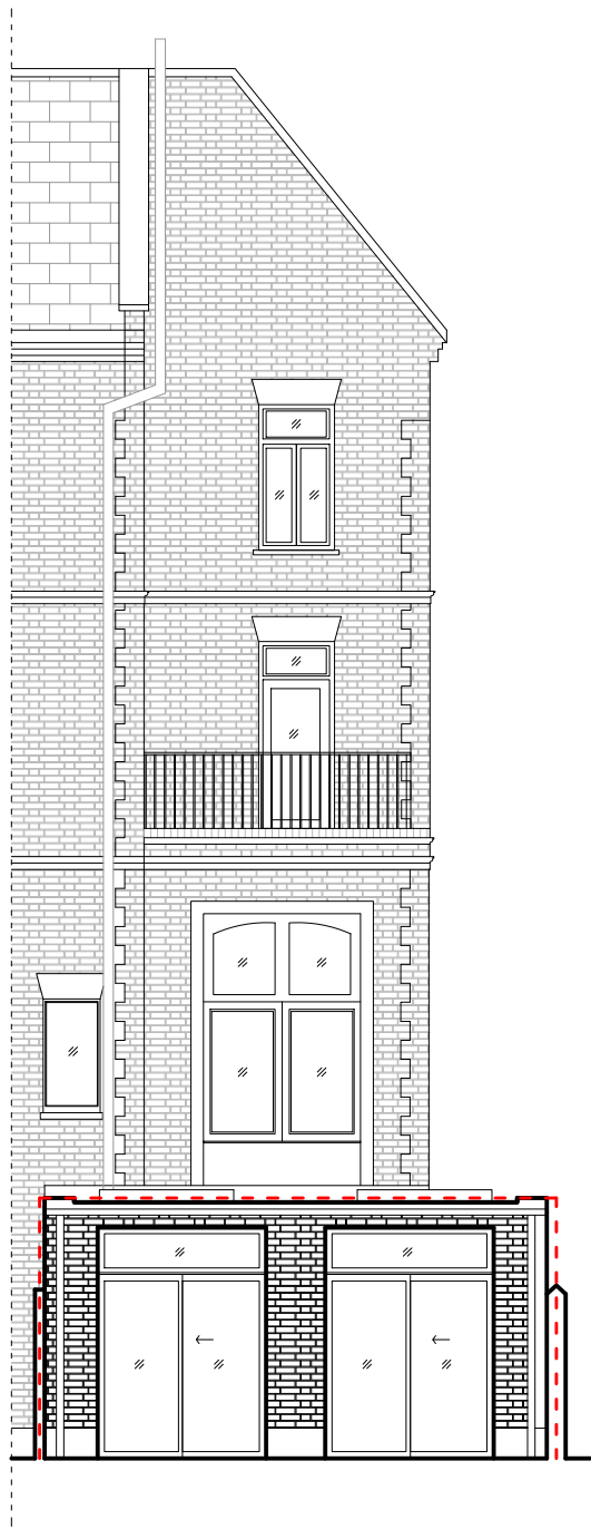
1 PROPOSED REAR ELEVATION scale 1:100@A3; 1:200@A4