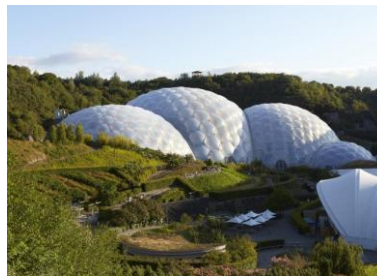
The Eden Project in Cornwall Sir Nicholas Grimshaw