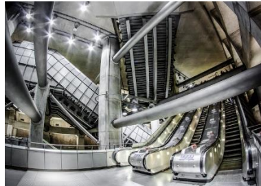
The Lloyds Building Baron Richard Rogers