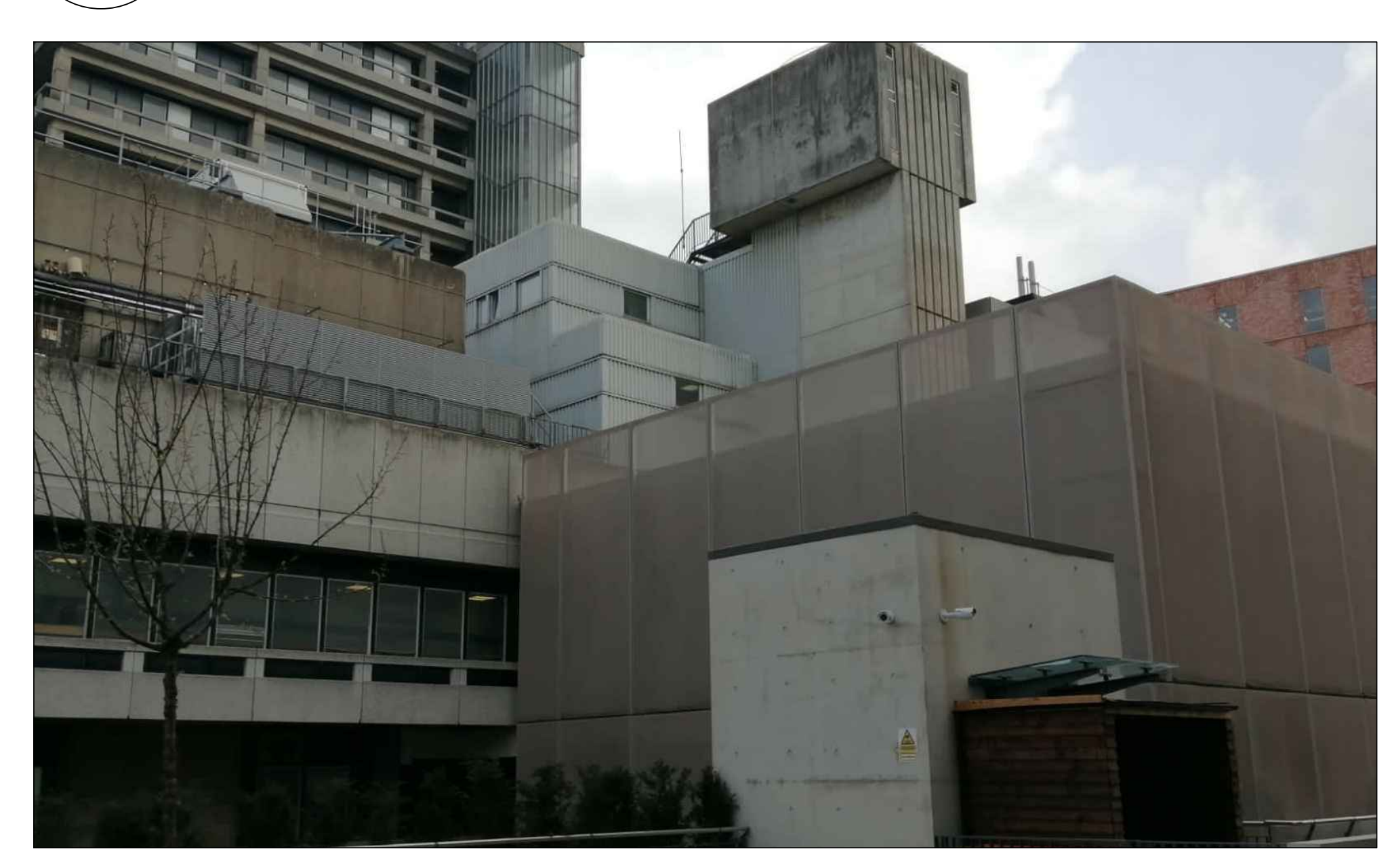
05 Existing Site Photographs (00)003 NTS