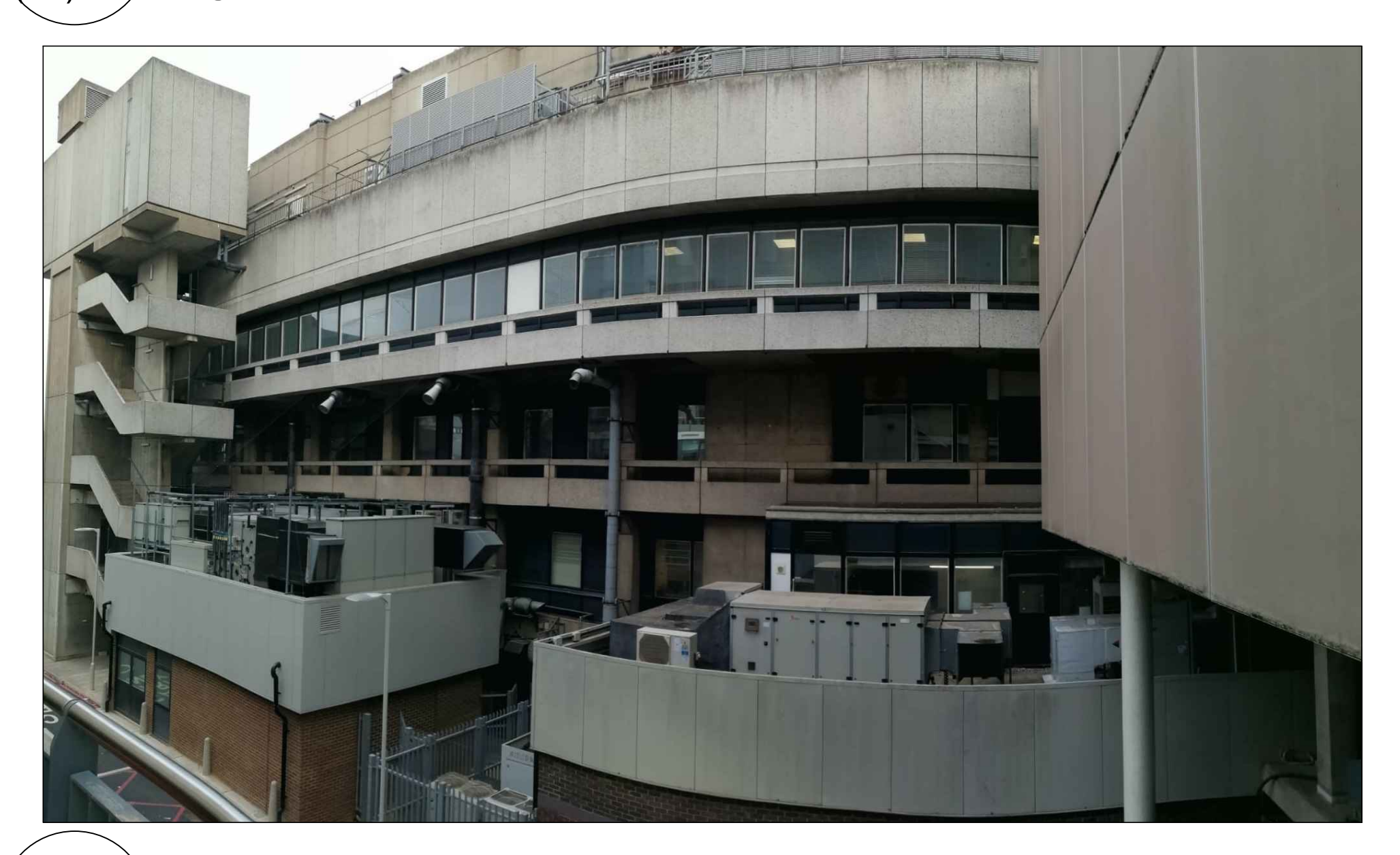
04 Existing Site Photographs (00)003 NTS