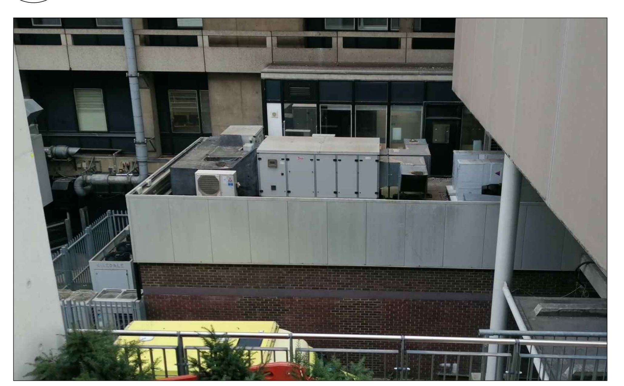
06 Existing Site Photographs (00)003 NTS