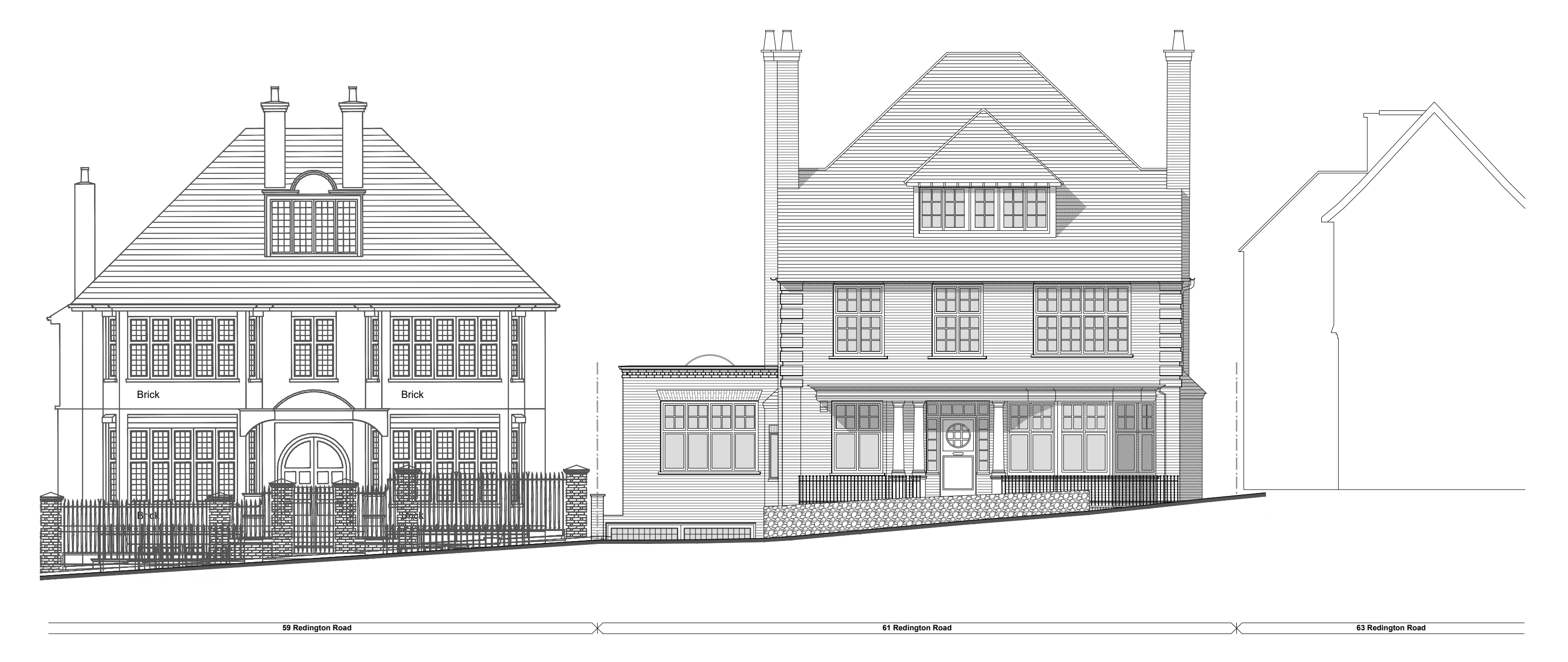
Proposed Street Scene