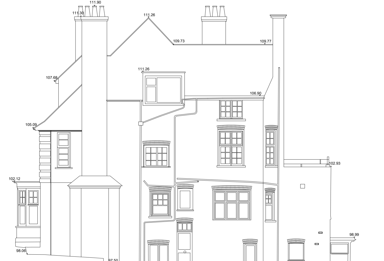
Existing Flank Elevation