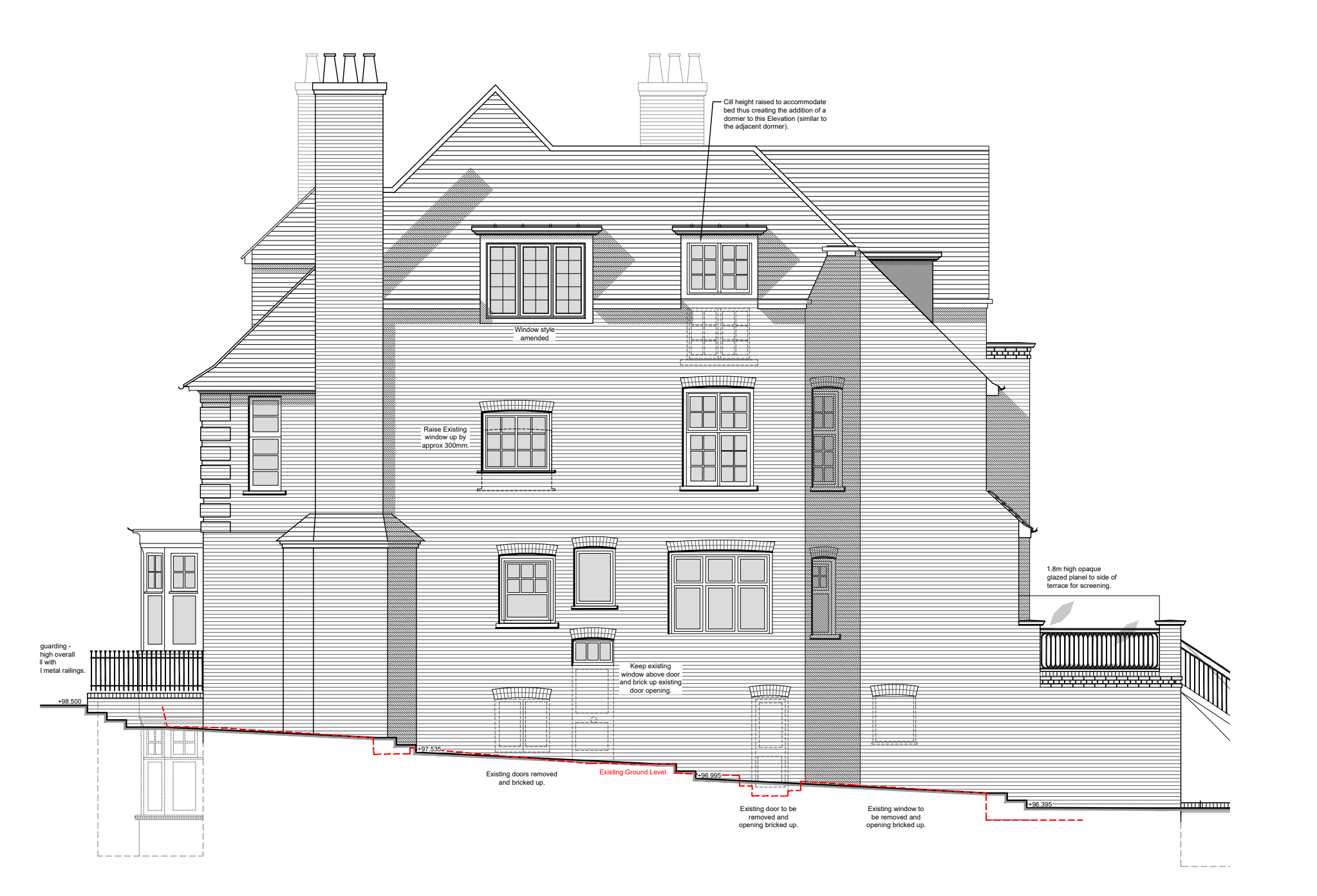
Proposed Flank Elevation