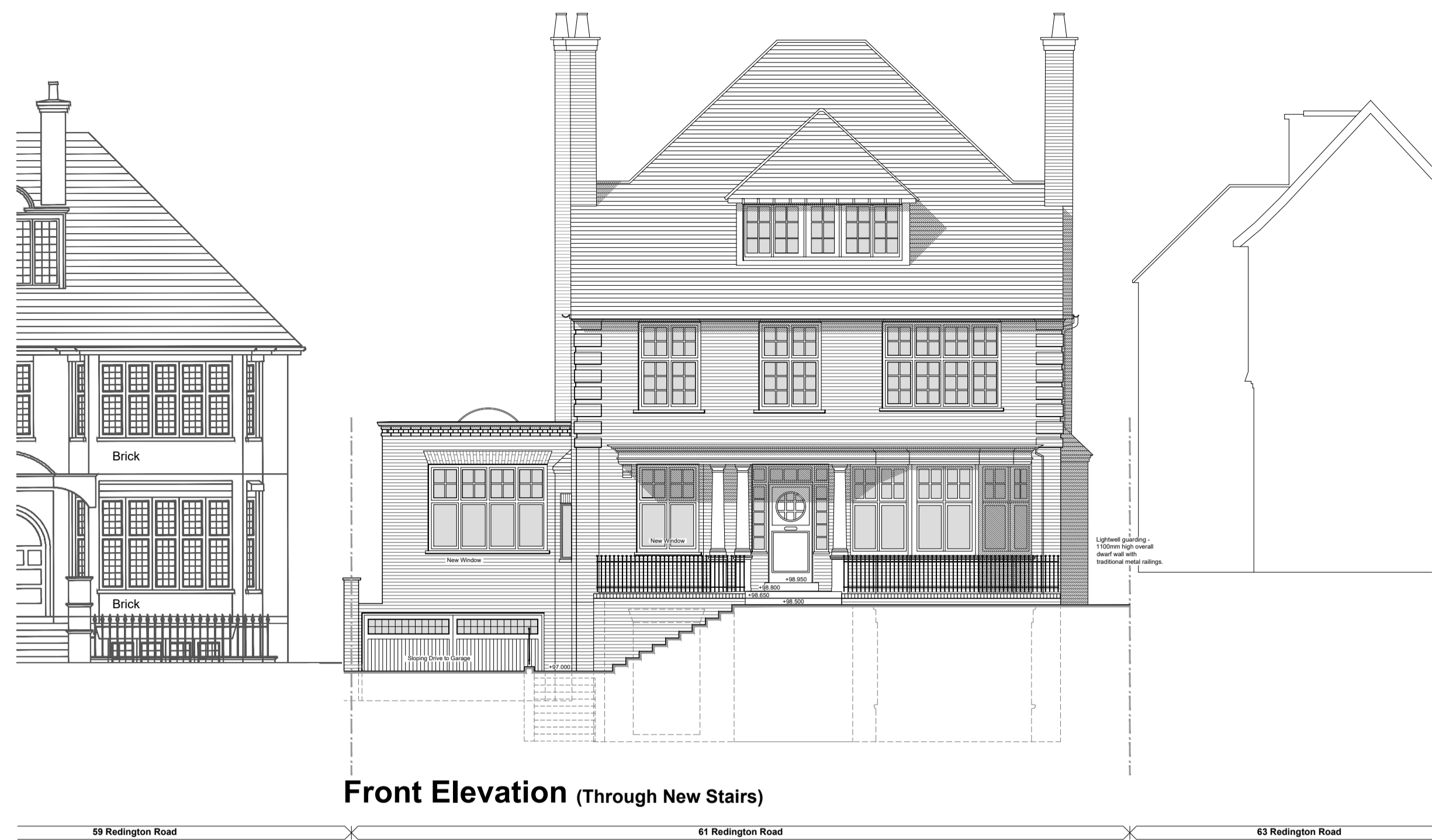
Front Elevation (Through New Stairs)