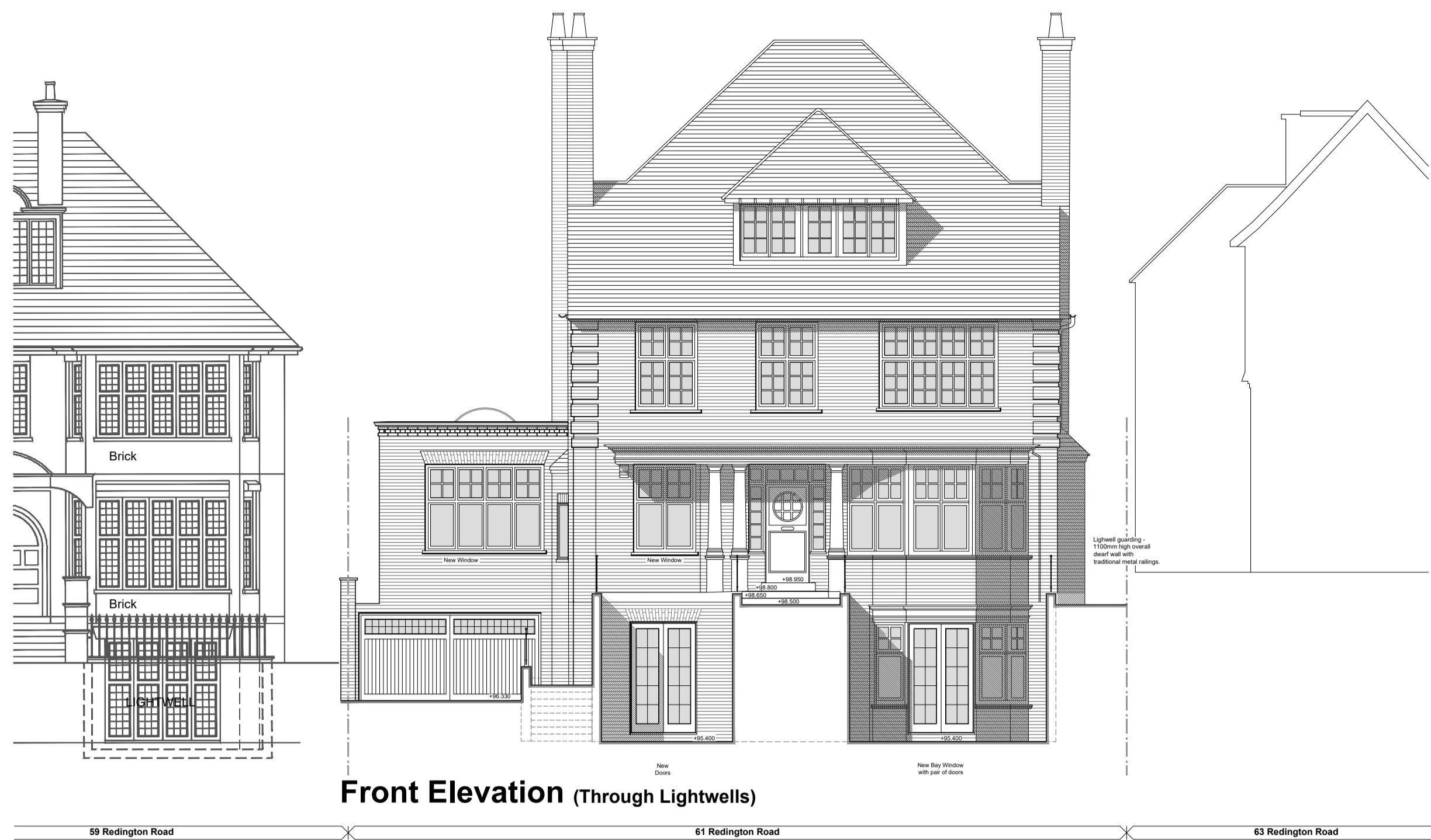
Front Elevation (Through Lightwells)