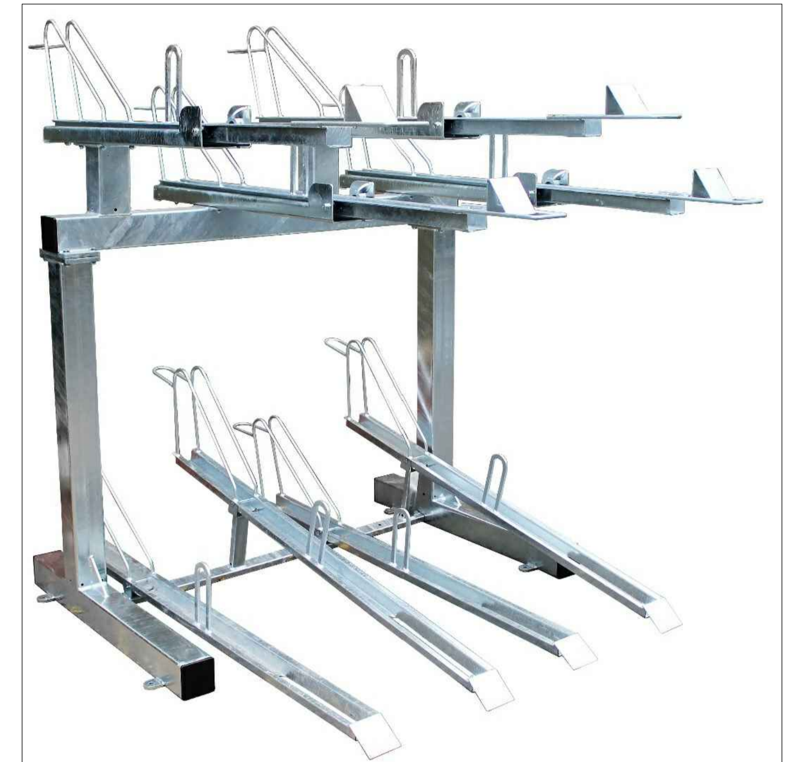
Two Tier Bicycle Rack