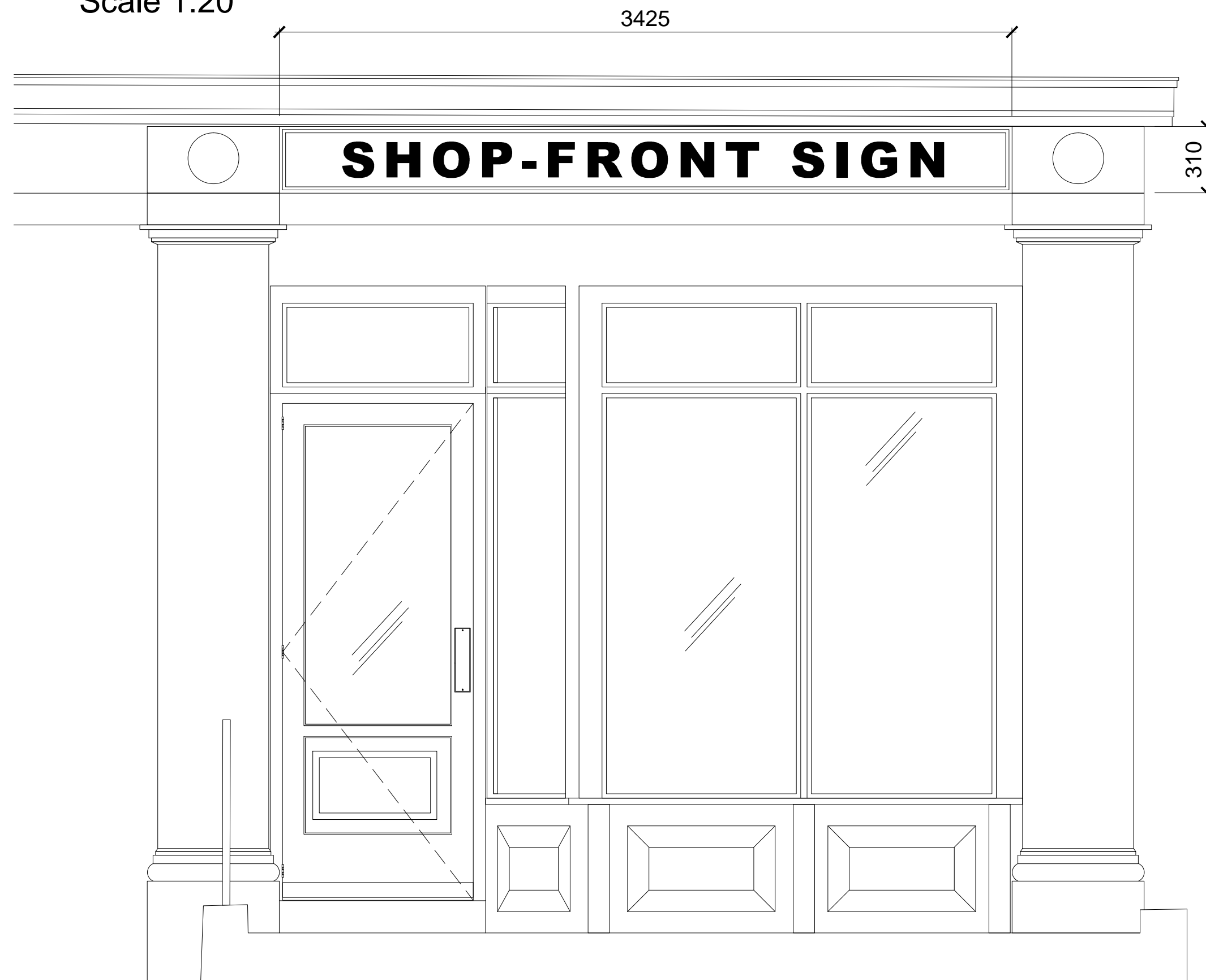
New Shop-front - Elevation Scale 1:20