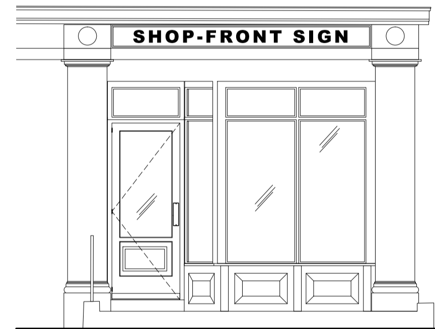
New Shop-front - Elevation Scale 1:50

Shop-front notes: a. shop to have no awnings, capital or console brackets. b. commercial unit signage to have no illumination or any projecting signs.