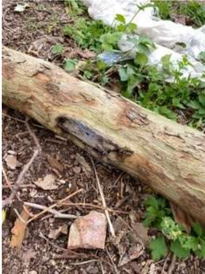
Photograph 2: Massaria canker on removed branch