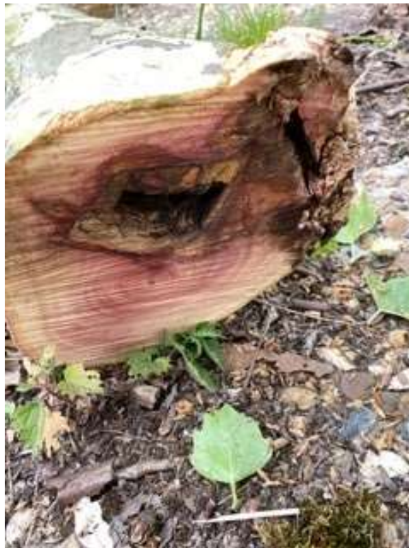
Photograph 1: Example of Massaria colonised branch removed during deadwooding operation

Web: www.landmarktrees.co.uk e-mail: info@landmarktrees.co.uk Tel: 0207 851 4544