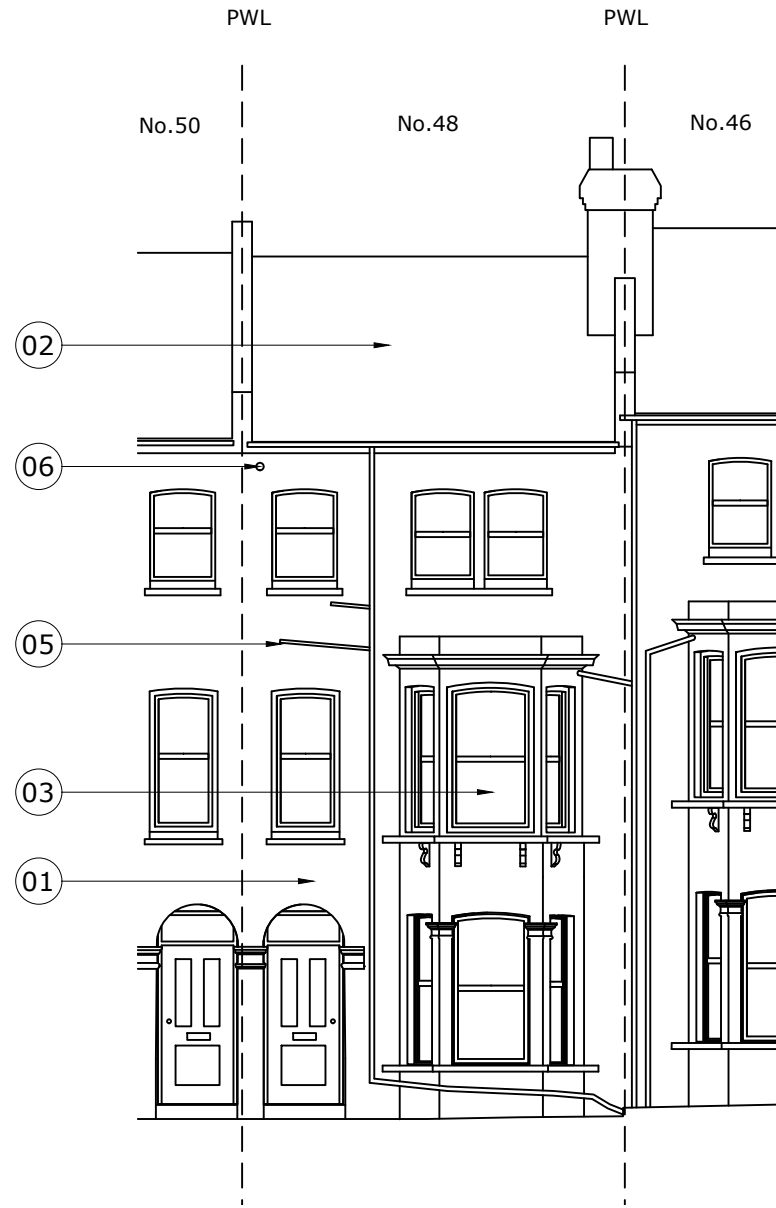
01 Existing_Front Elevation 01 300 Scale 1:100@A3