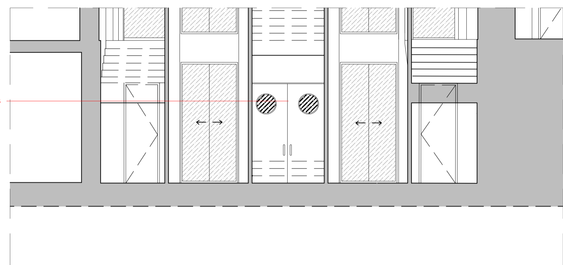
2 SECTION 1:50