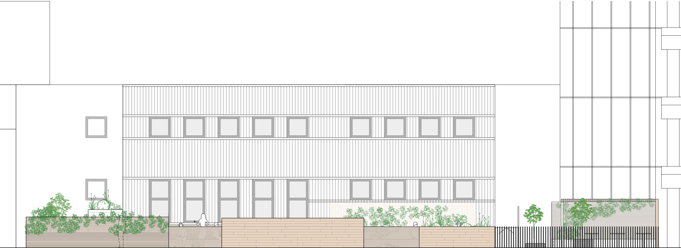
ELEVATION A1 – VIEW FROM ROWLAND HILL STREET showing balustrading and screening