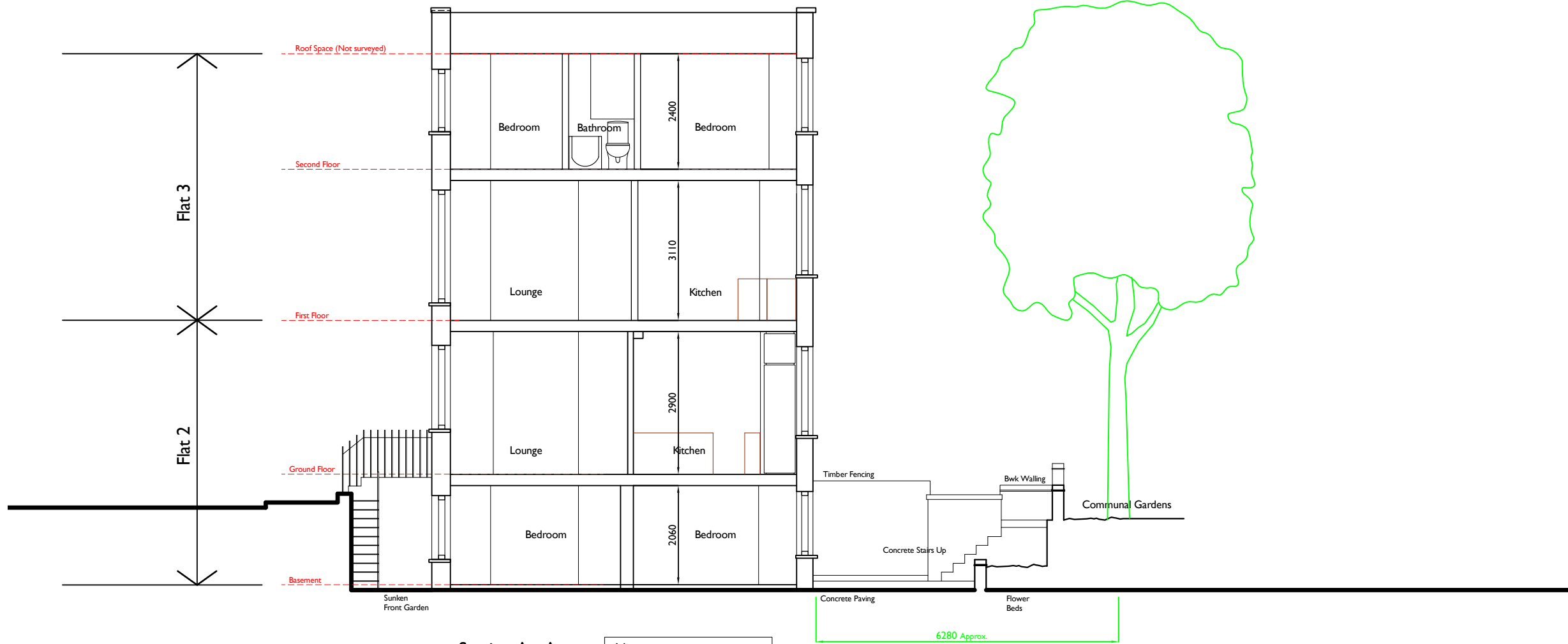
Section A - A

Note: Floor to ceiling dimensions averaged across each floor