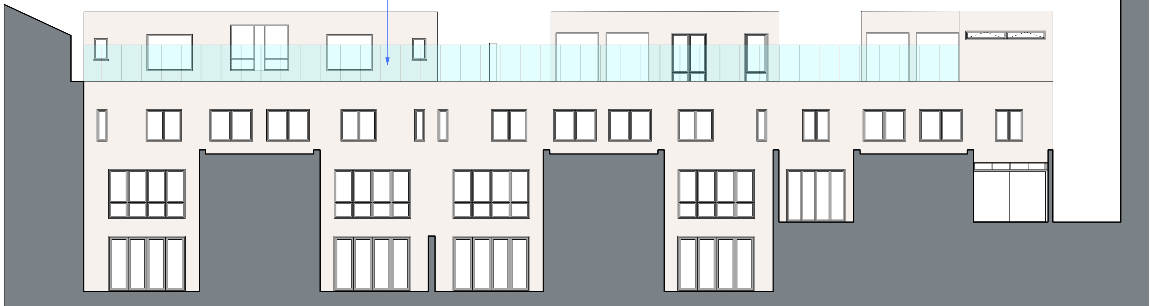
2 South Elevation Scale: 1:100

Door (relocated from previous terrace entrance) to be installed from extension (under construction) at No.2 Whittlebury Mews West