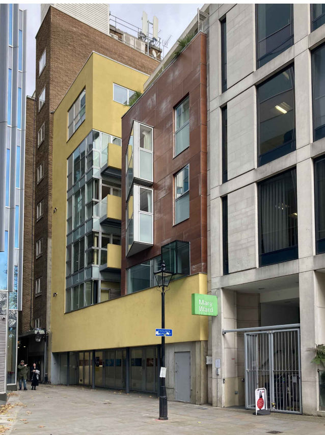
Existing front elevation to Great Turnstile