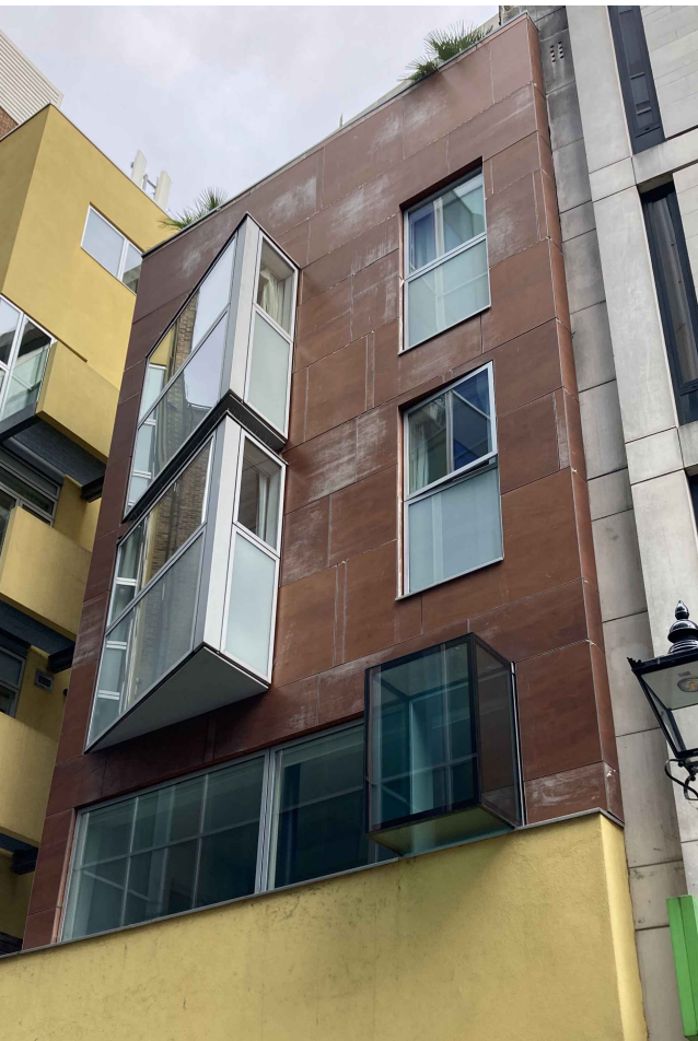
HPL rainscreen cladding to be removed and replaced