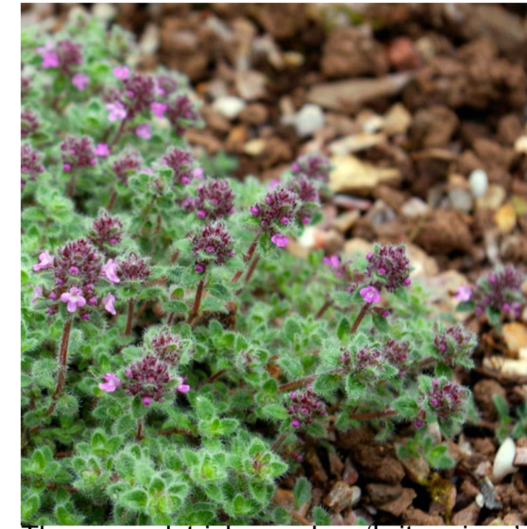
Thymus polytrichus subsp 'britannicus'