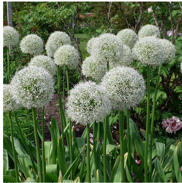
Allium purple sensation.