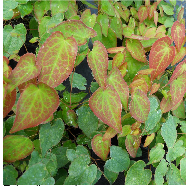
Epimedium x rubrum