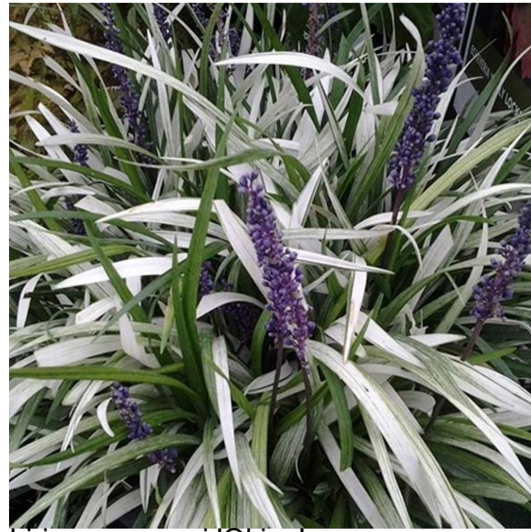
Liriope muscari 'Okina'