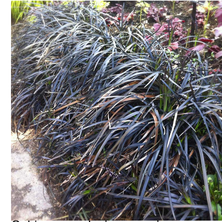
Ophiopogon planiscapus nigrescens