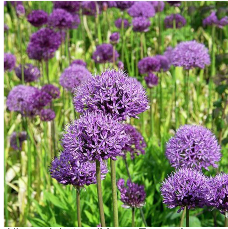
Allium stipitatum 'Mount Everest'