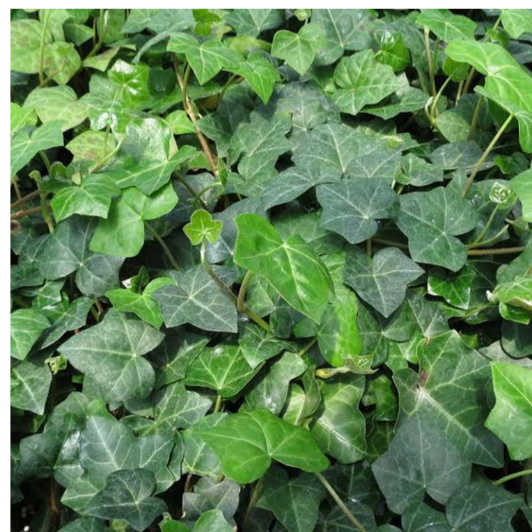
Hedera helix wilsonii