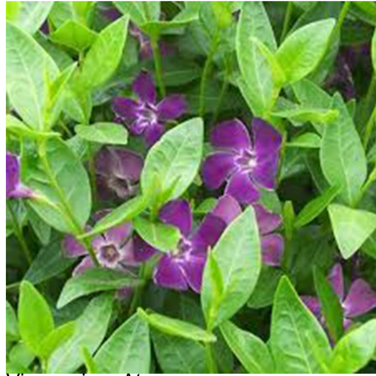
Vinca minor Atropurpurea