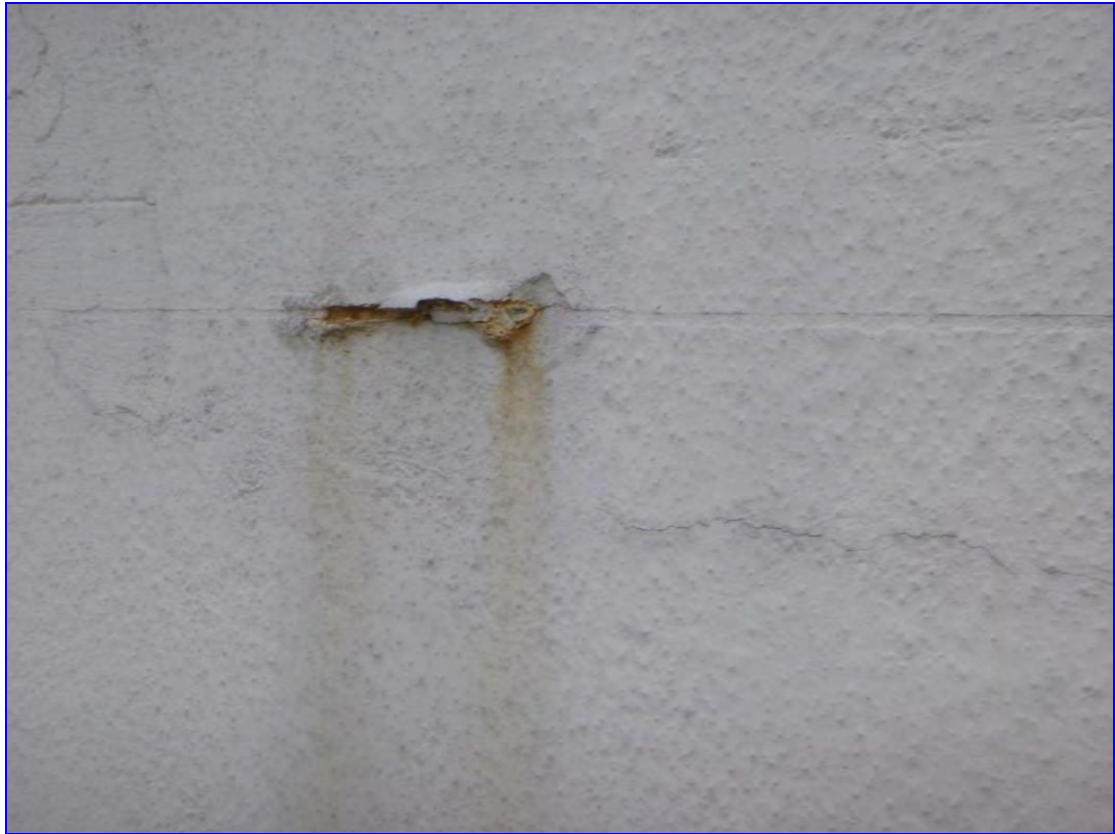
Photograph 31: Defect no. Defect no. 68.