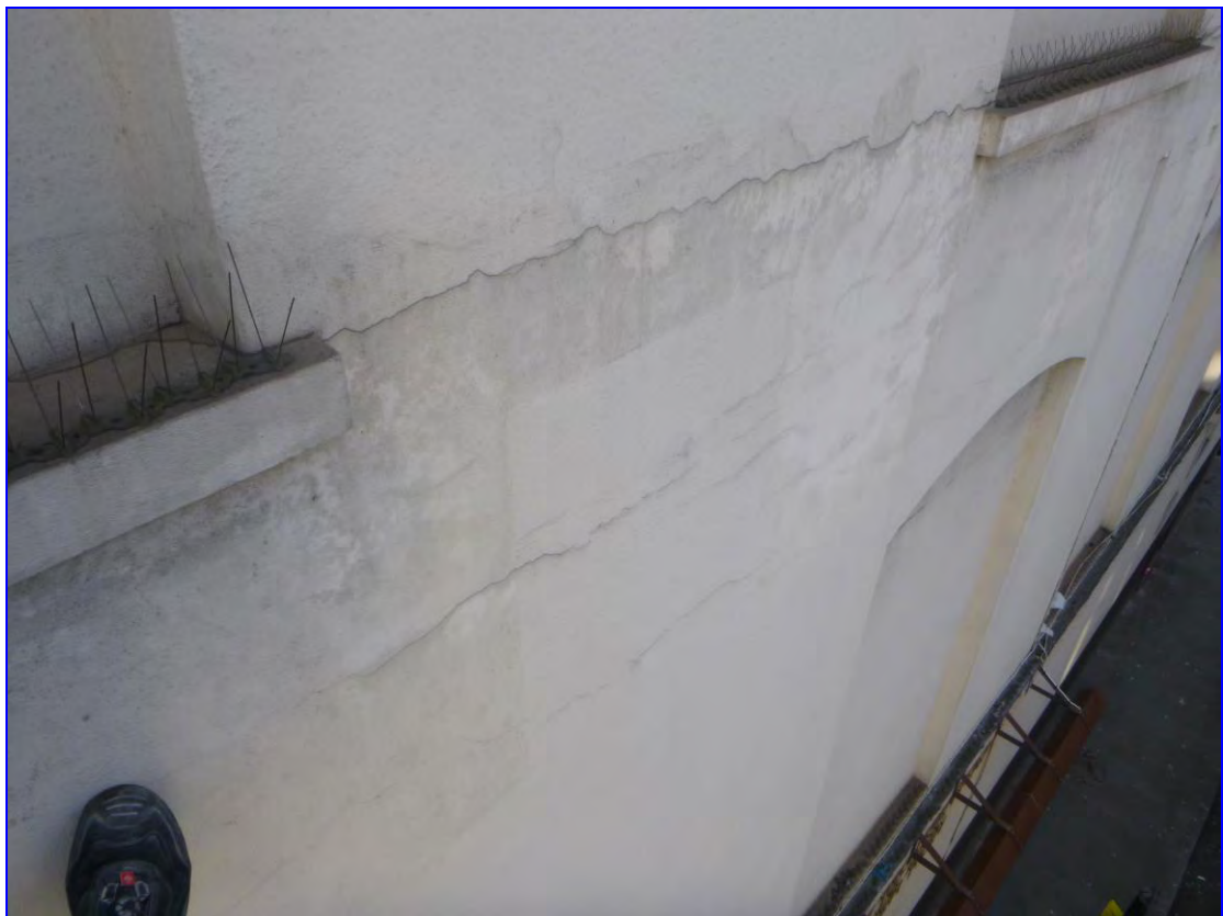
Photograph 30: Defect no. 67.