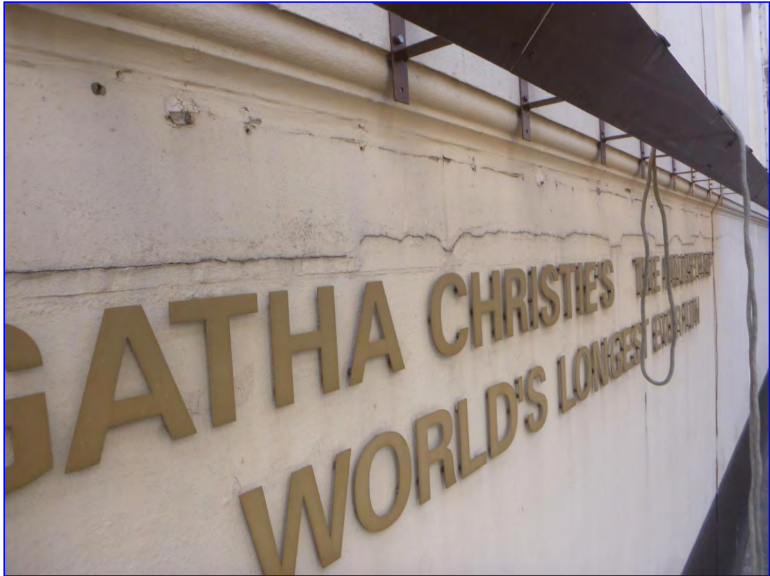
Photograph 33: Defect no. 69.