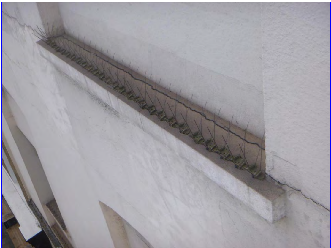
Photograph 28: Defect no. 65.