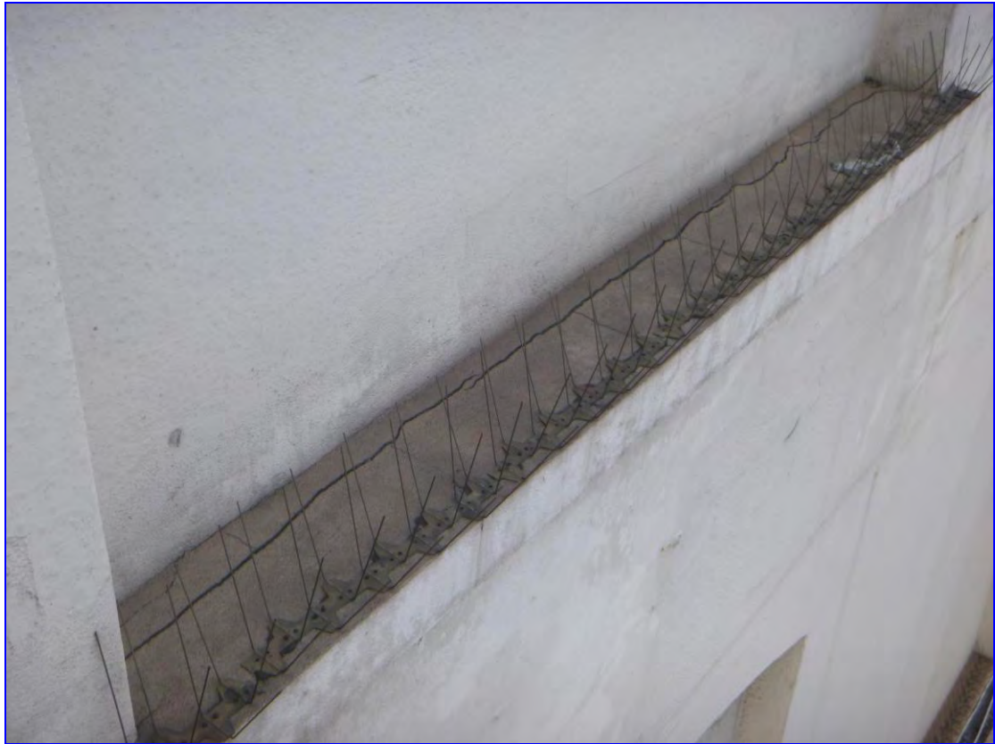
Photograph 29: Defect no. 66.