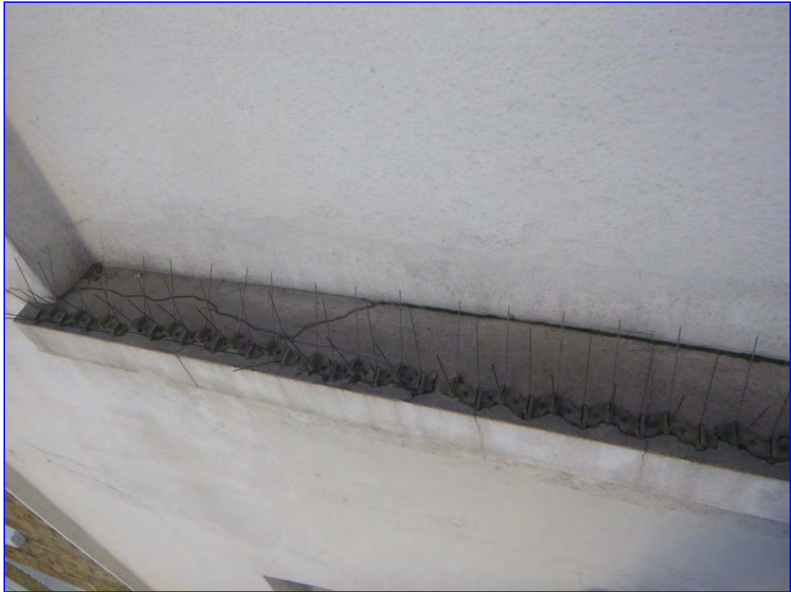
Photograph 27: Defect no. 63.