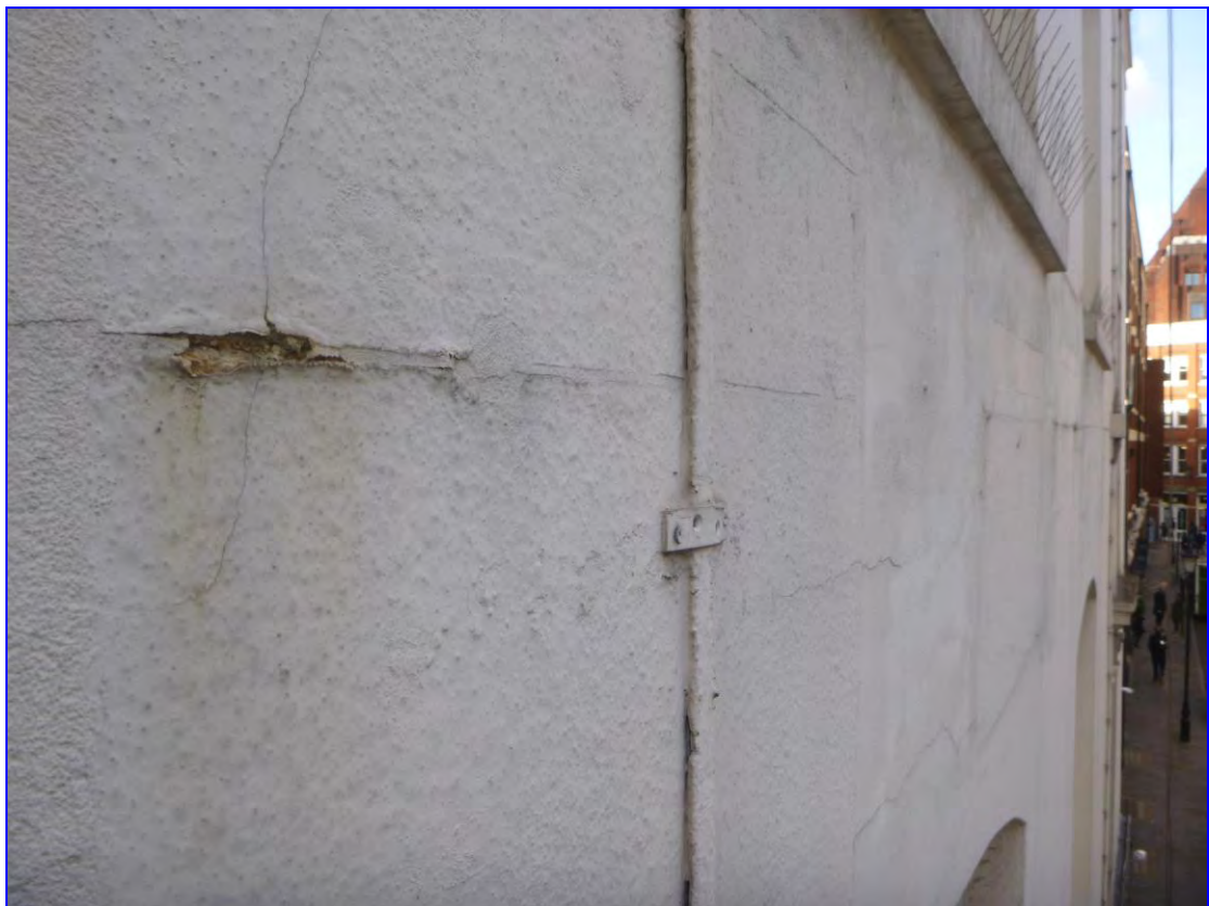
Photograph 32: Defect no. Defect no. 68 – another example.