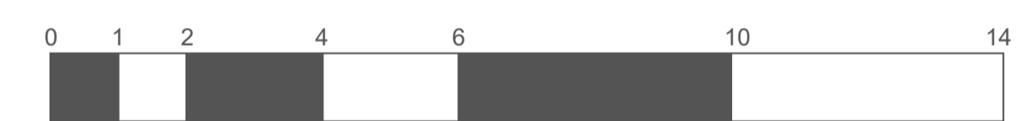
Scale Bar 1:100 (m)