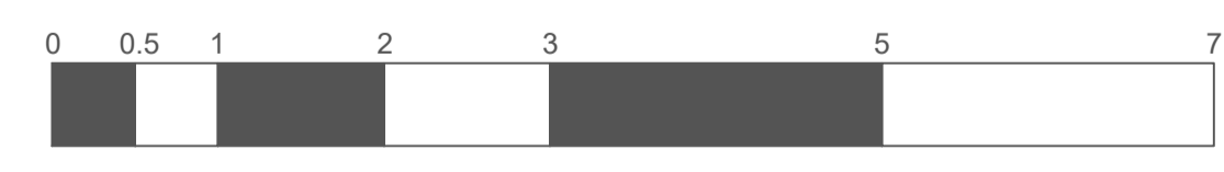
Scale Bar 1:50 (m)