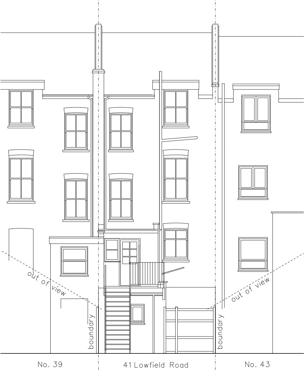
2. REAR (WEST) ELEVATION