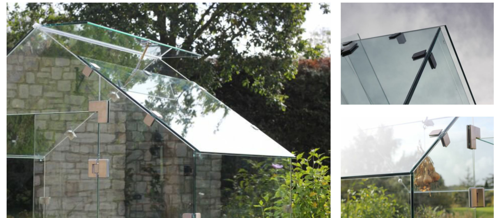
D-07-402 Green House Design Intent - Manufactures photos showing 'frameless' detail 04 Hatton Garden

GENERAL NOTES: This drawing remains the copyright of Andy Sturgeon Garden Design Limited. All dimensions to be checked prior to commencement of any works, and/or preparation of any shop drawings on site. Any dimensional discrepancies and alterations to be referred to the designer. DO NOT SCALE FROM THIS DRAWING.