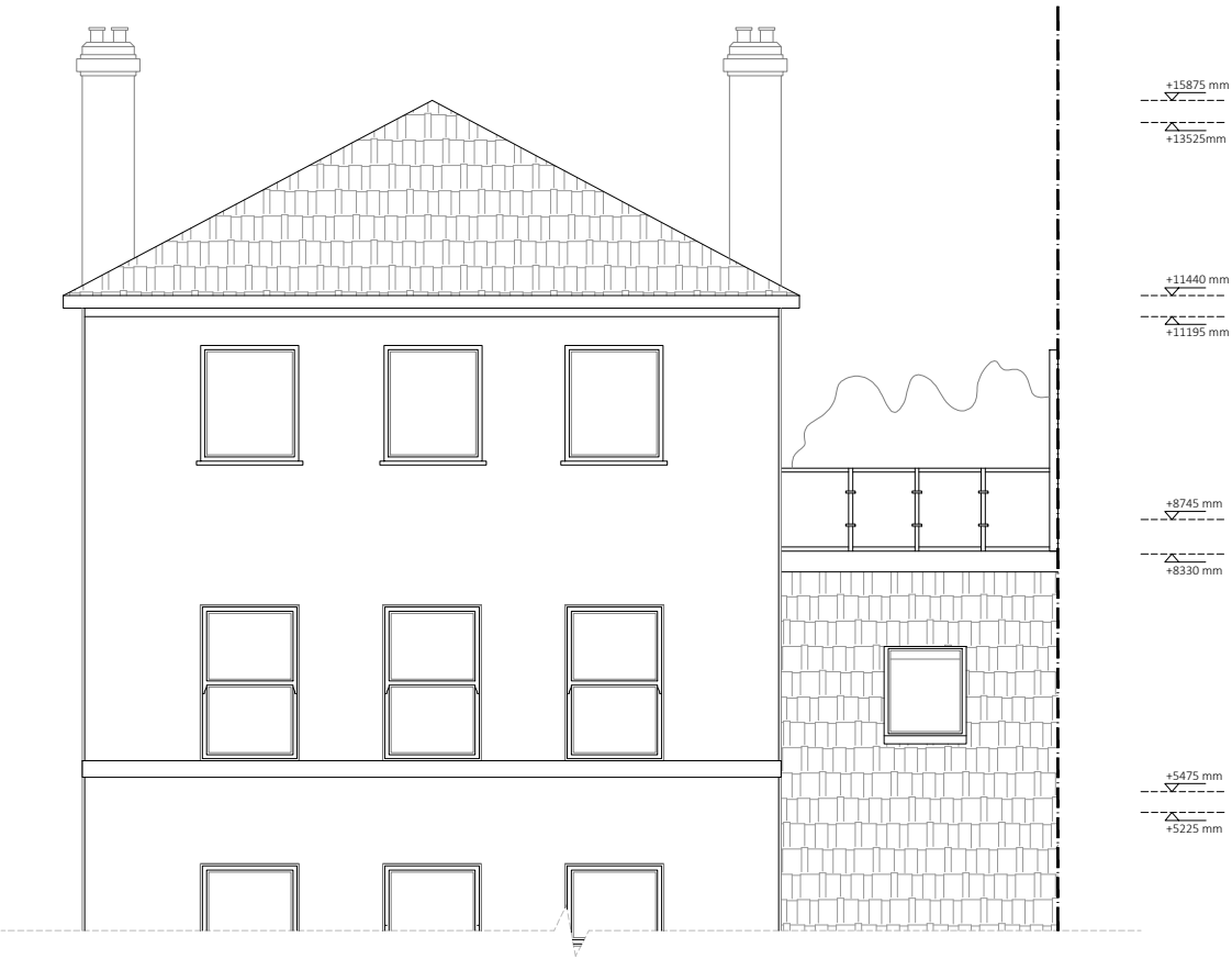
PROPOSED REAR ELEVATION (No changes)