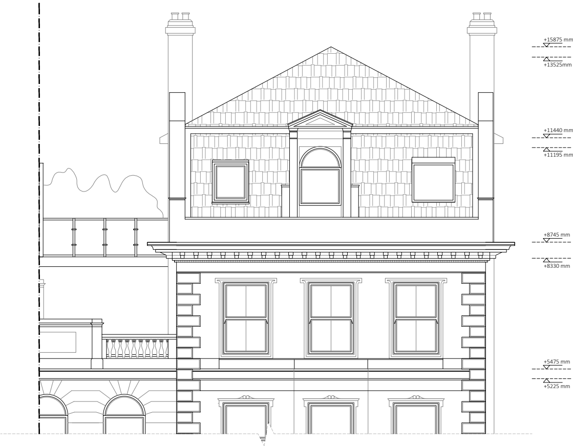
PROPOSED FRONT ELEVATION (No changes)