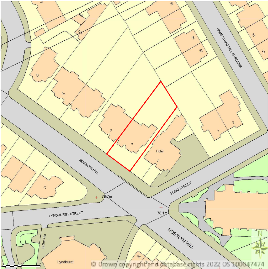
LOCATION PLAN Sc. 1/1250