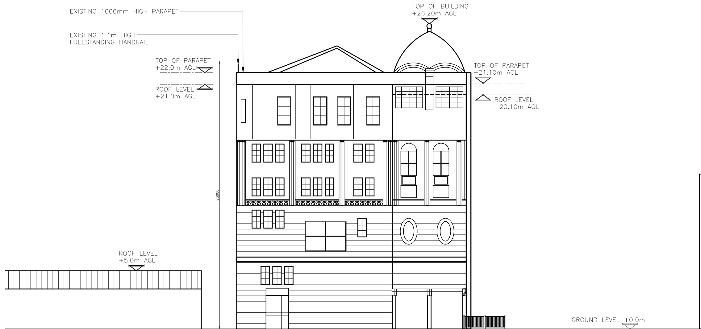
EXISTING NORTH ELEVATION (1:200)

10000 5000 0 5000 10000 15000 ORIGINAL SCALE AT A3 - 1:200 ALL DIMENSIONS IN MILLIMETRES