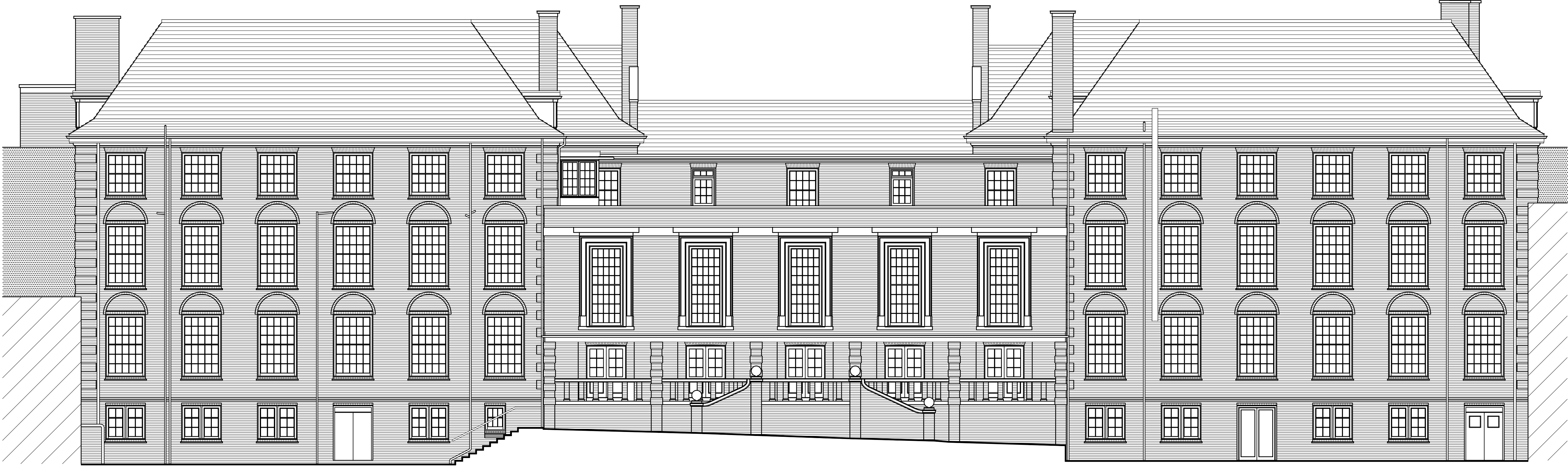
REAR ELEVATION D - SOUTH WEST