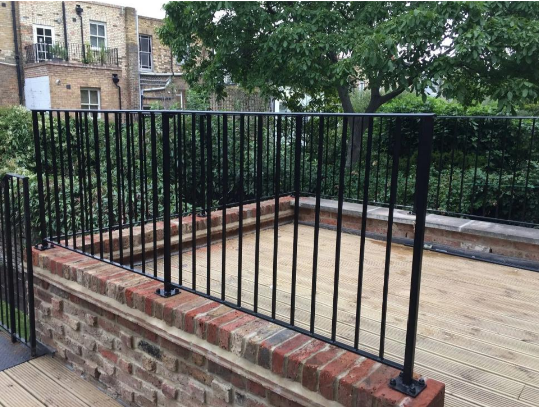
Example of railing style proposed. (Position of proposed to be on exg line of current railings - not necessarily as indicated above).

Copyright: All rights reserved. This drawing must not be reproduced without permission. Only the original drawing should be relied upon. Contractors, sub-contractors and suppliers must verify all dimensions on site before commencing any work or making any shop drawings. All shop drawings to be submitted to the architect for comment prior to fabrication. This drawing is to be read in conjunction with the architect's specification, bills of quantities / schedules, structural, mechanical & electrical drawings and all discrepancies are to be reported to the architect. Do not scale from this drawing. Dimensions are in millimetres unless otherwise stated.