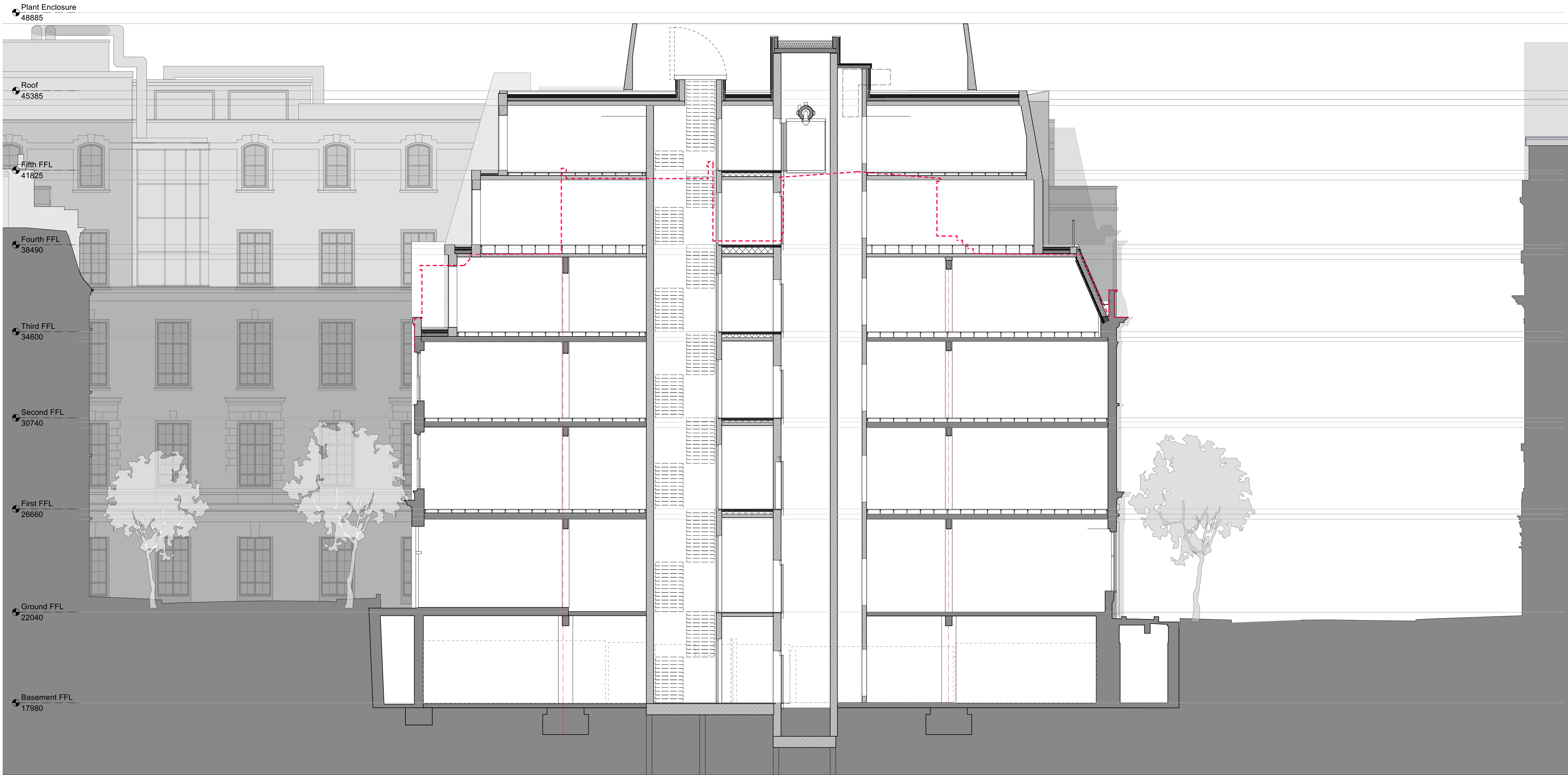
2 SECTION DD SCALE 1:200 @ A3