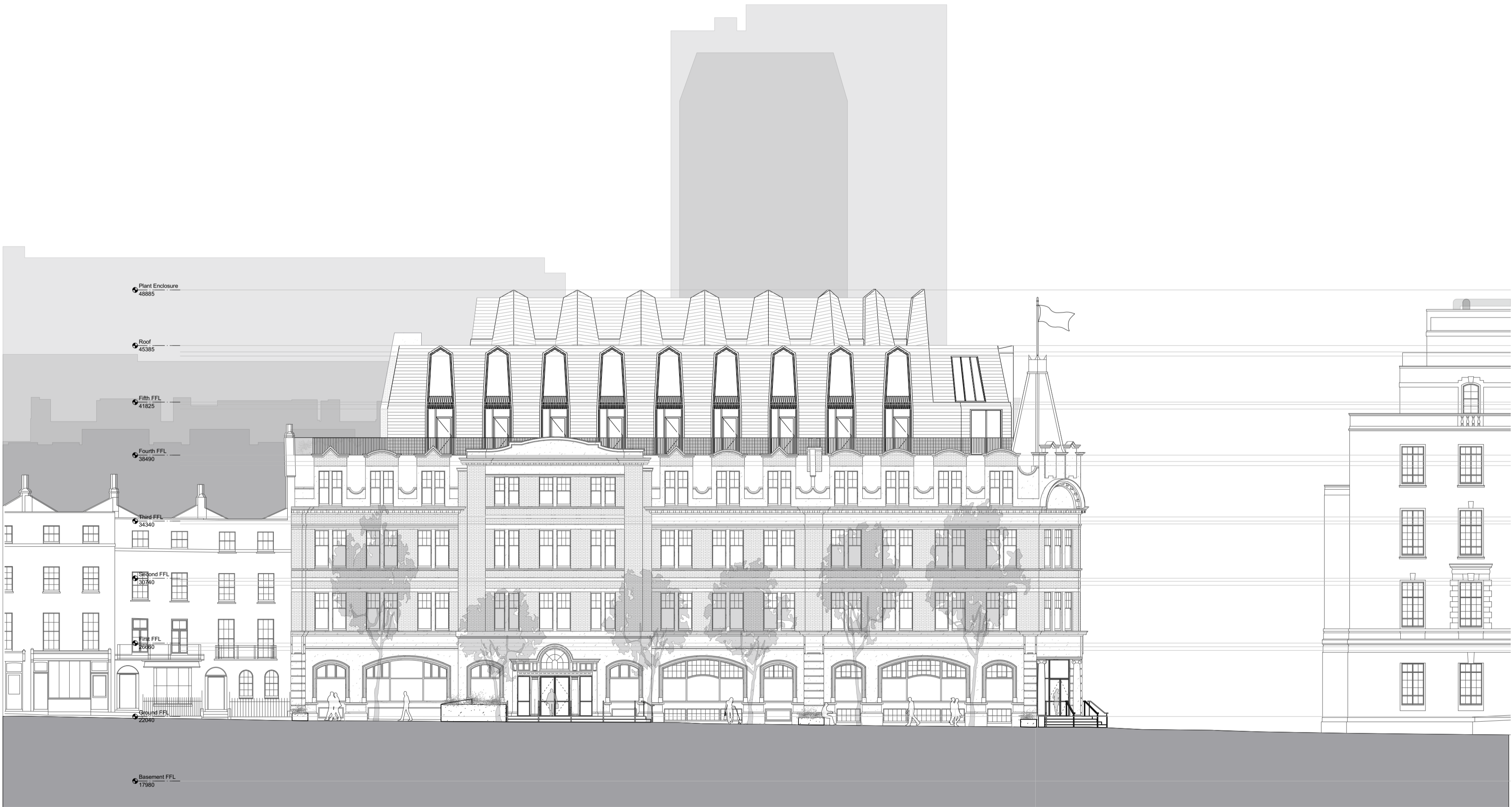
2 East Elevation Scale: 1:200