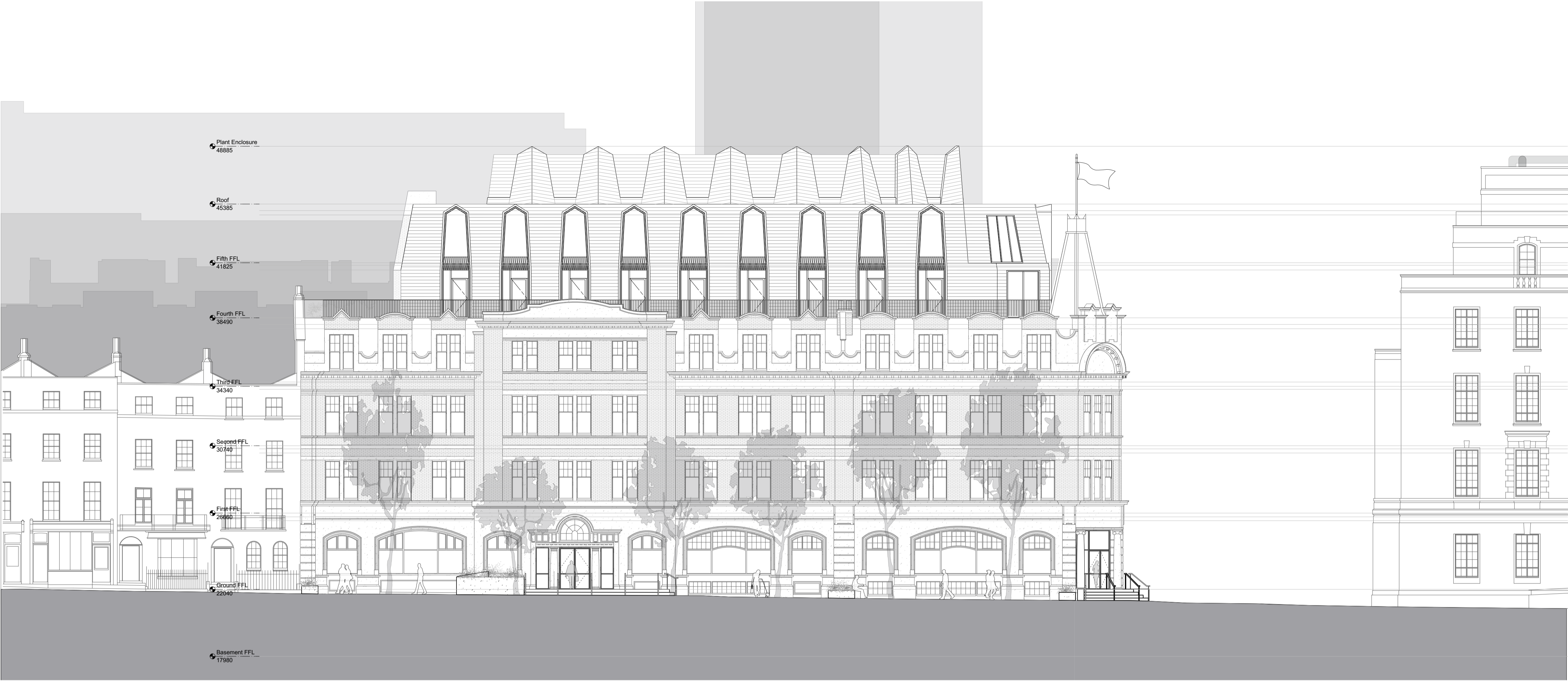
1 East Elevation Scale: 1:100