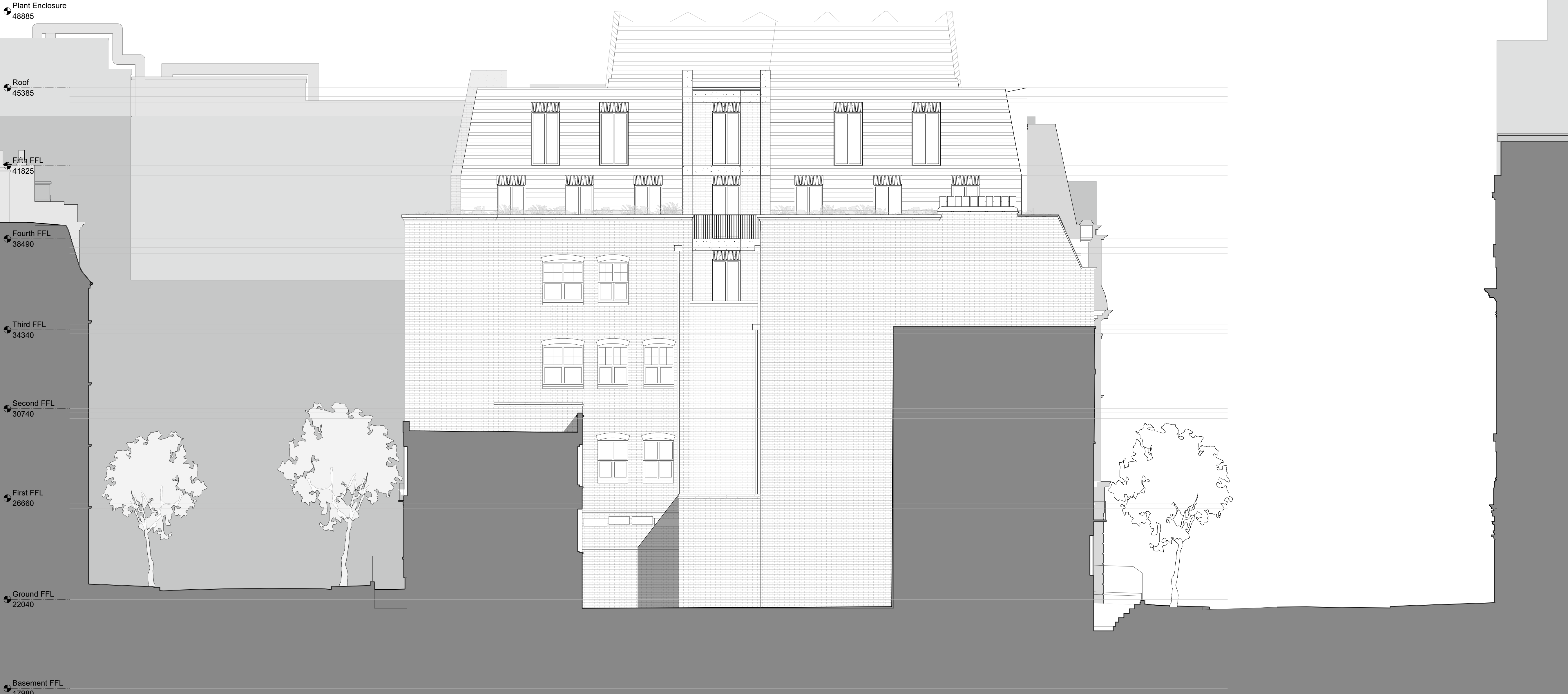
1 South Elevation Scale: 1:100