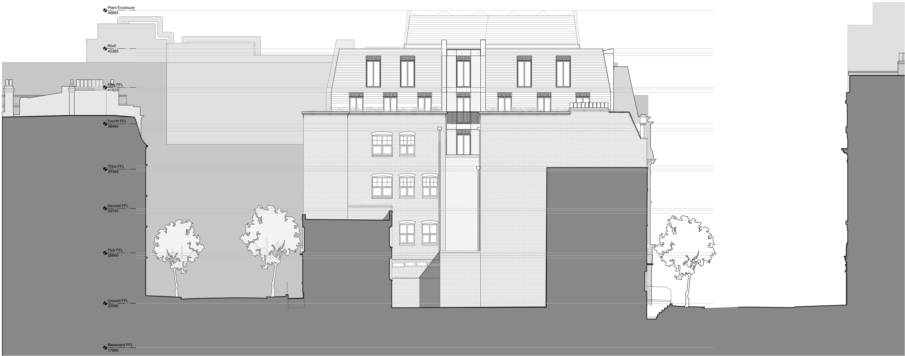
2 South Elevation Scale: 1:200