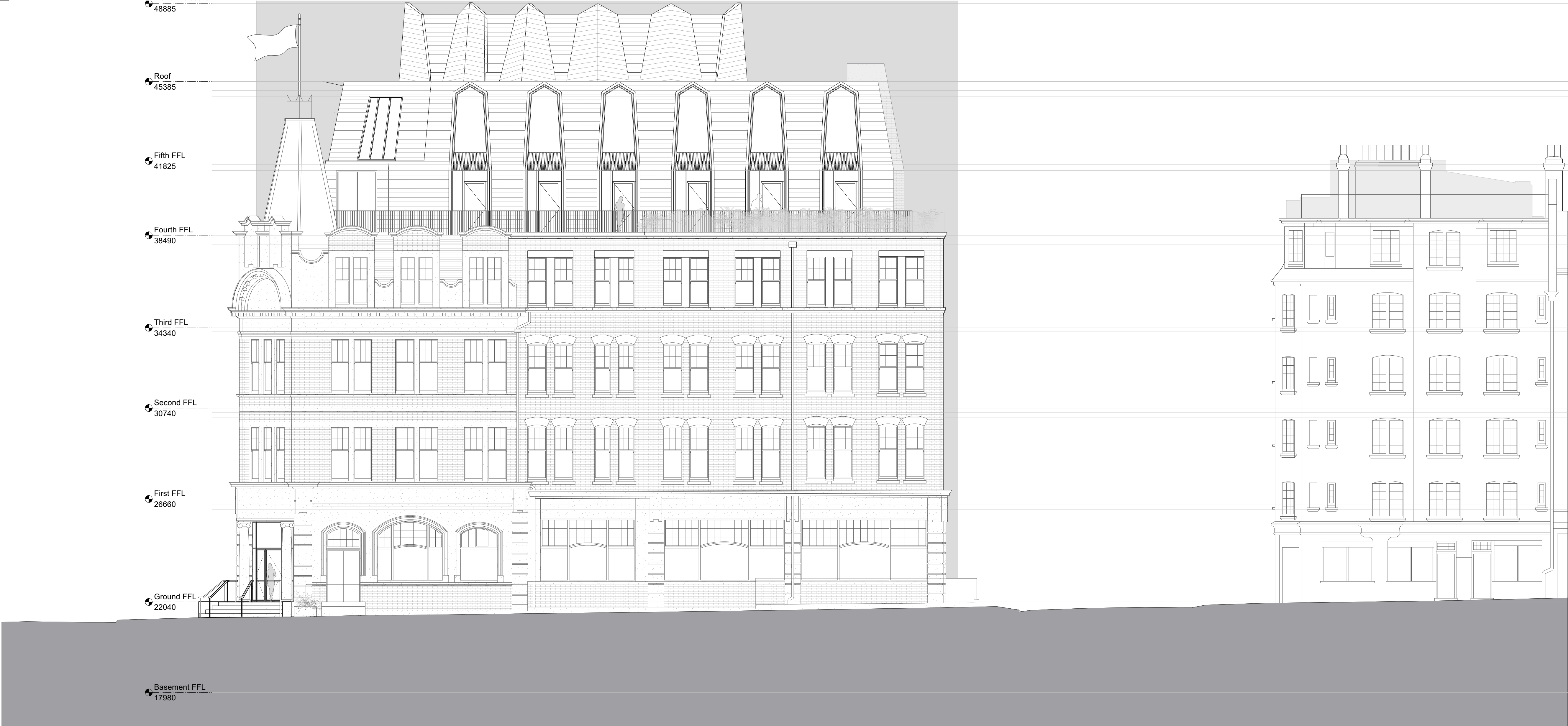
1 North Elevation Scale: 1:100