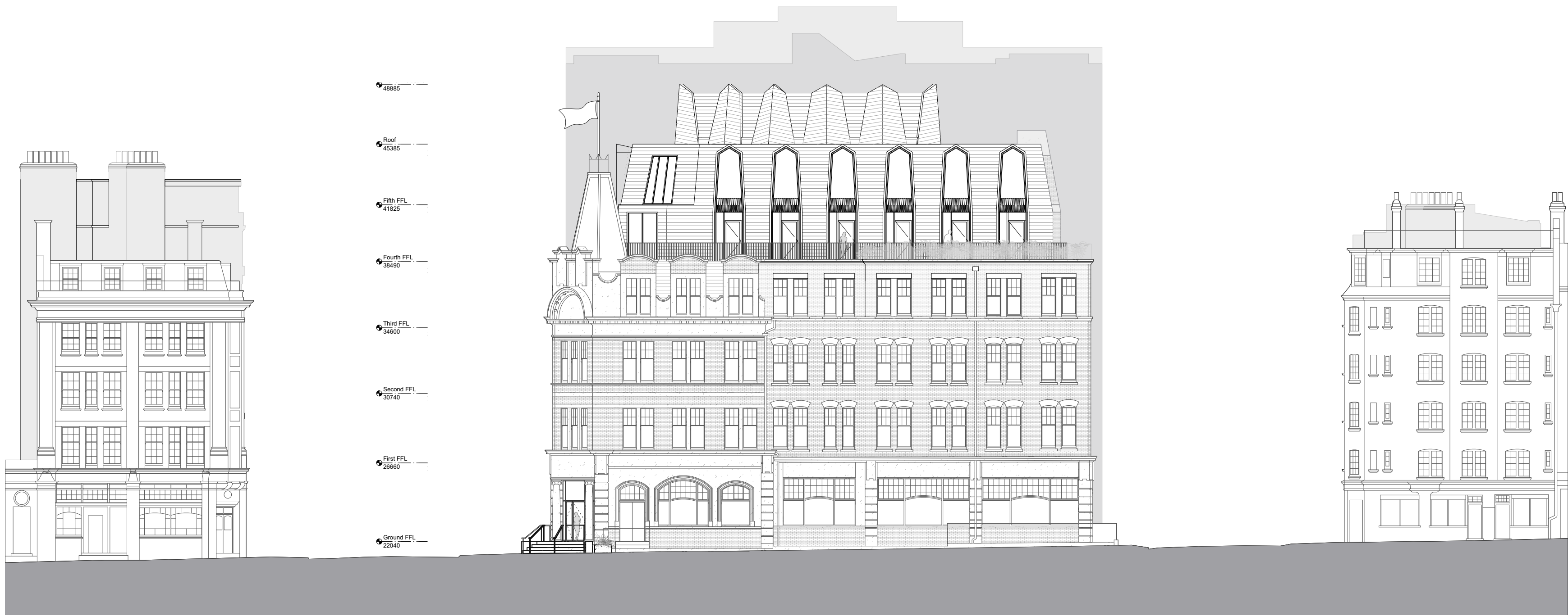
2 North Elevation Scale: 1:200