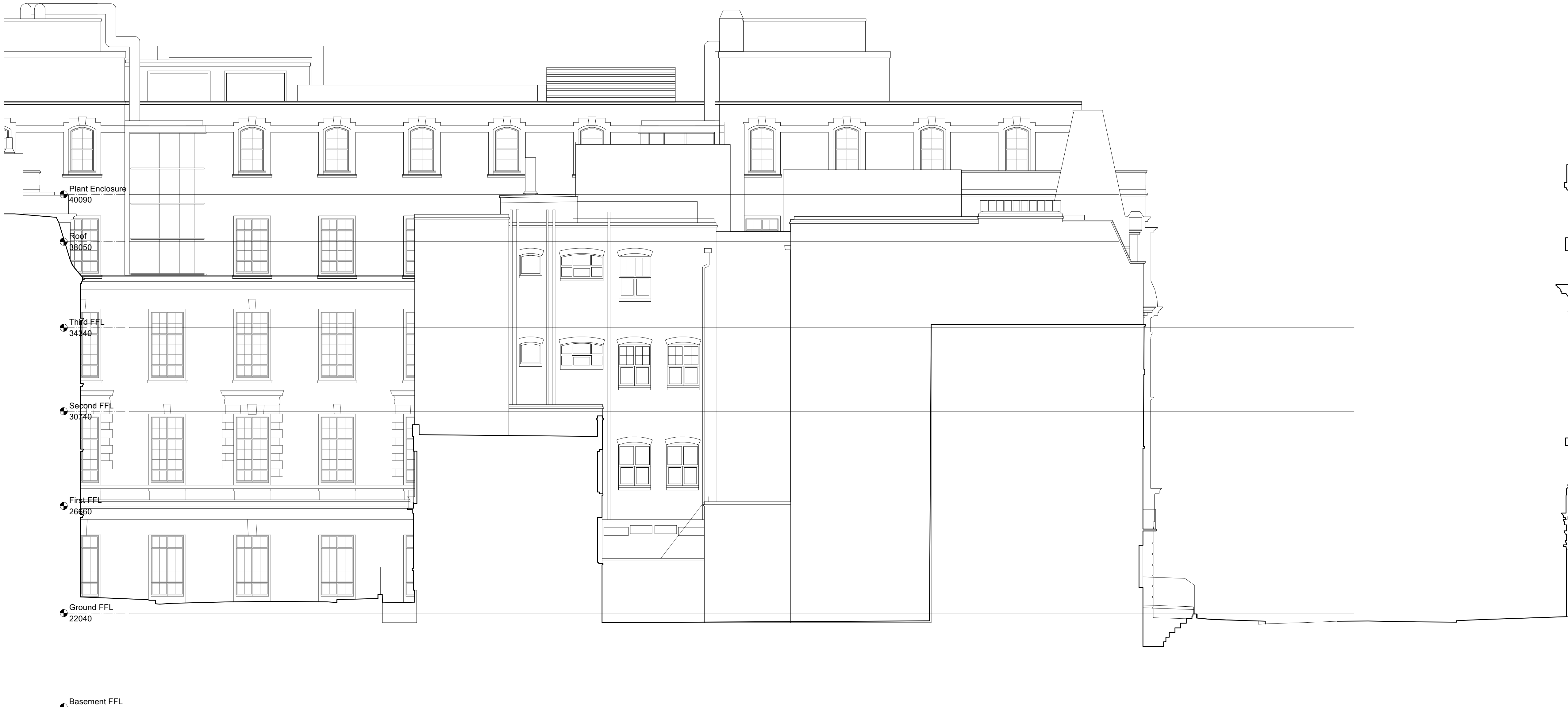
1 EXISTING NORTH ELEVATION Scale: 1:100