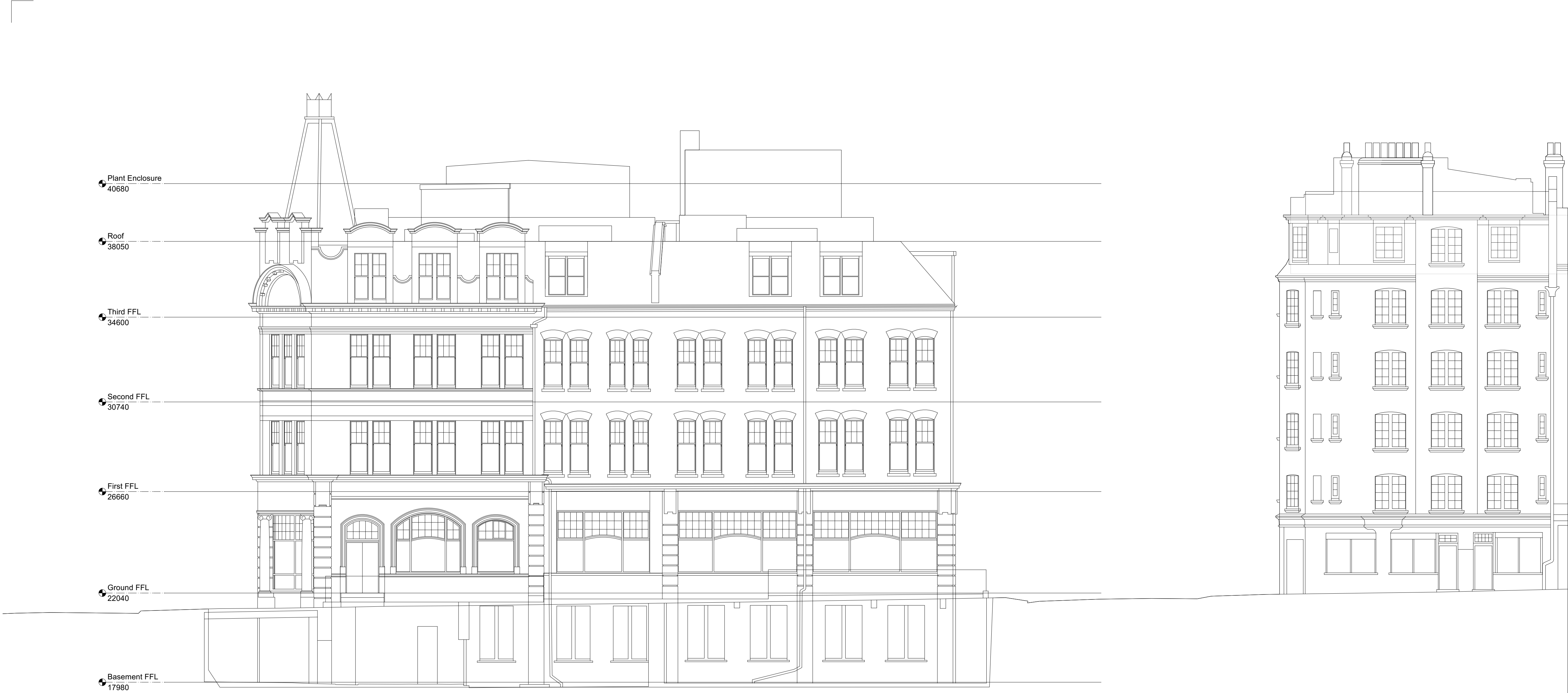
1 EXISTING NORTH ELEVATION Scale: 1:100