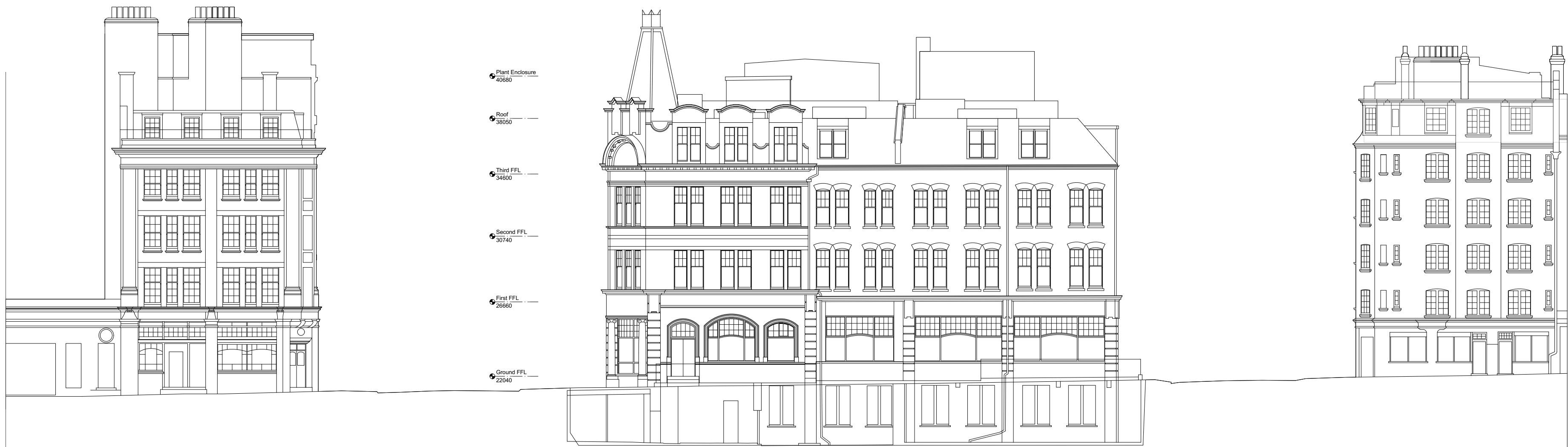
2 EXISTING NORTH ELEVATION Scale: 1:200