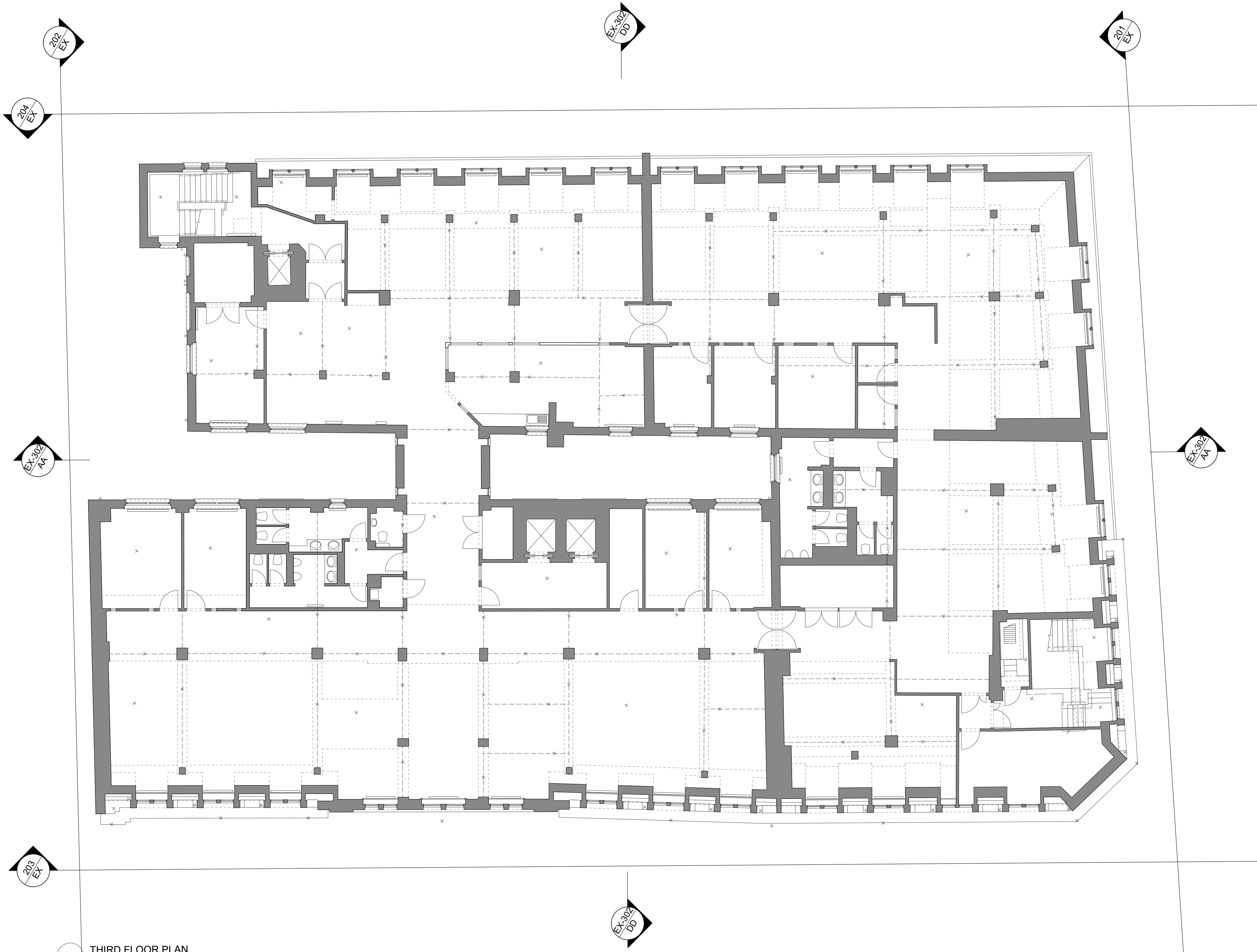
1 THIRD FLOOR PLAN SCALE 1:200 @ A3