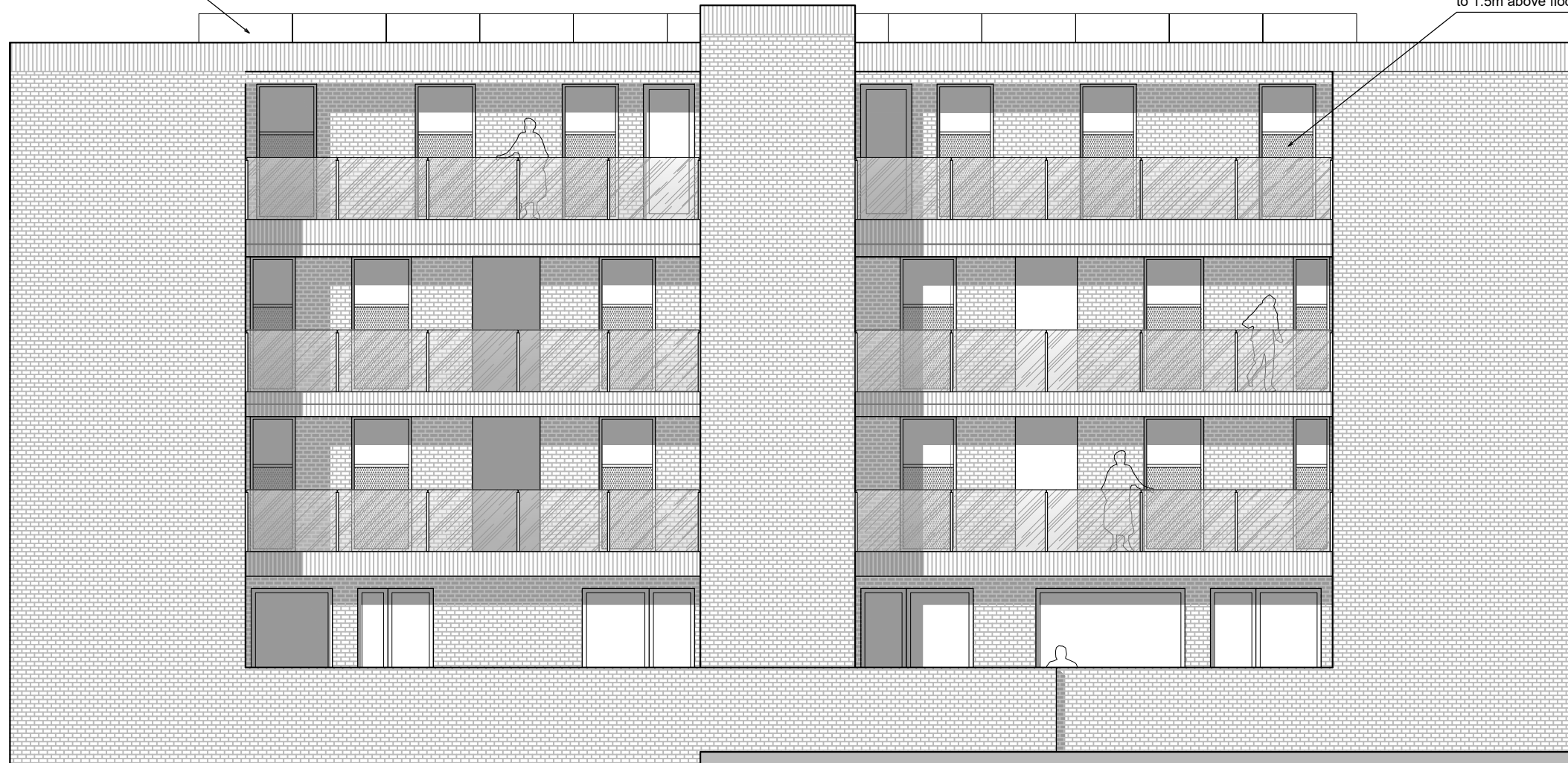
PROPOSED REAR ELEVATION (South) SCALE 1:100

Rear windows are translucent to 1.5m above floor level