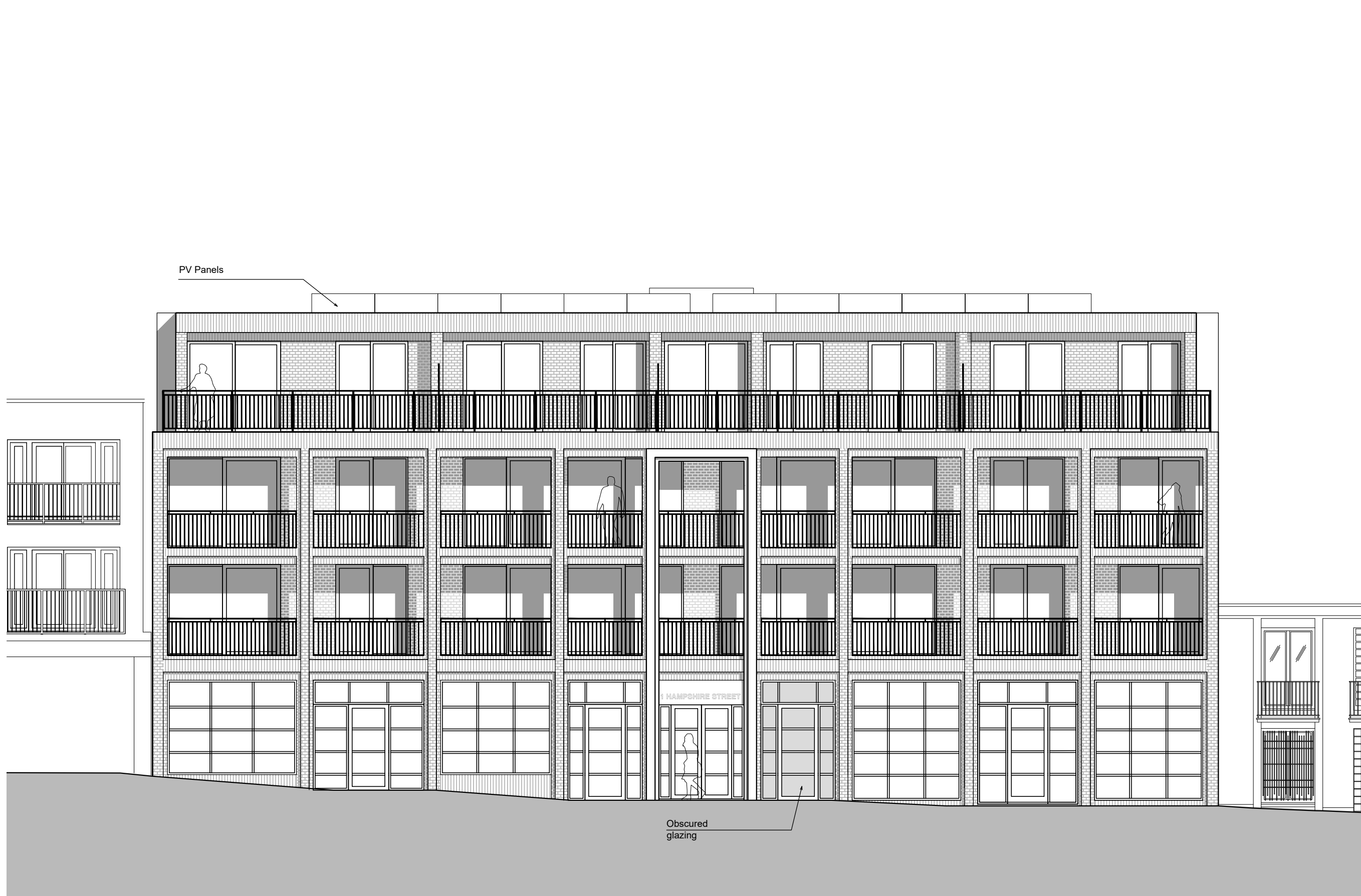
PROPOSED ELEVATION SCALE 1:100