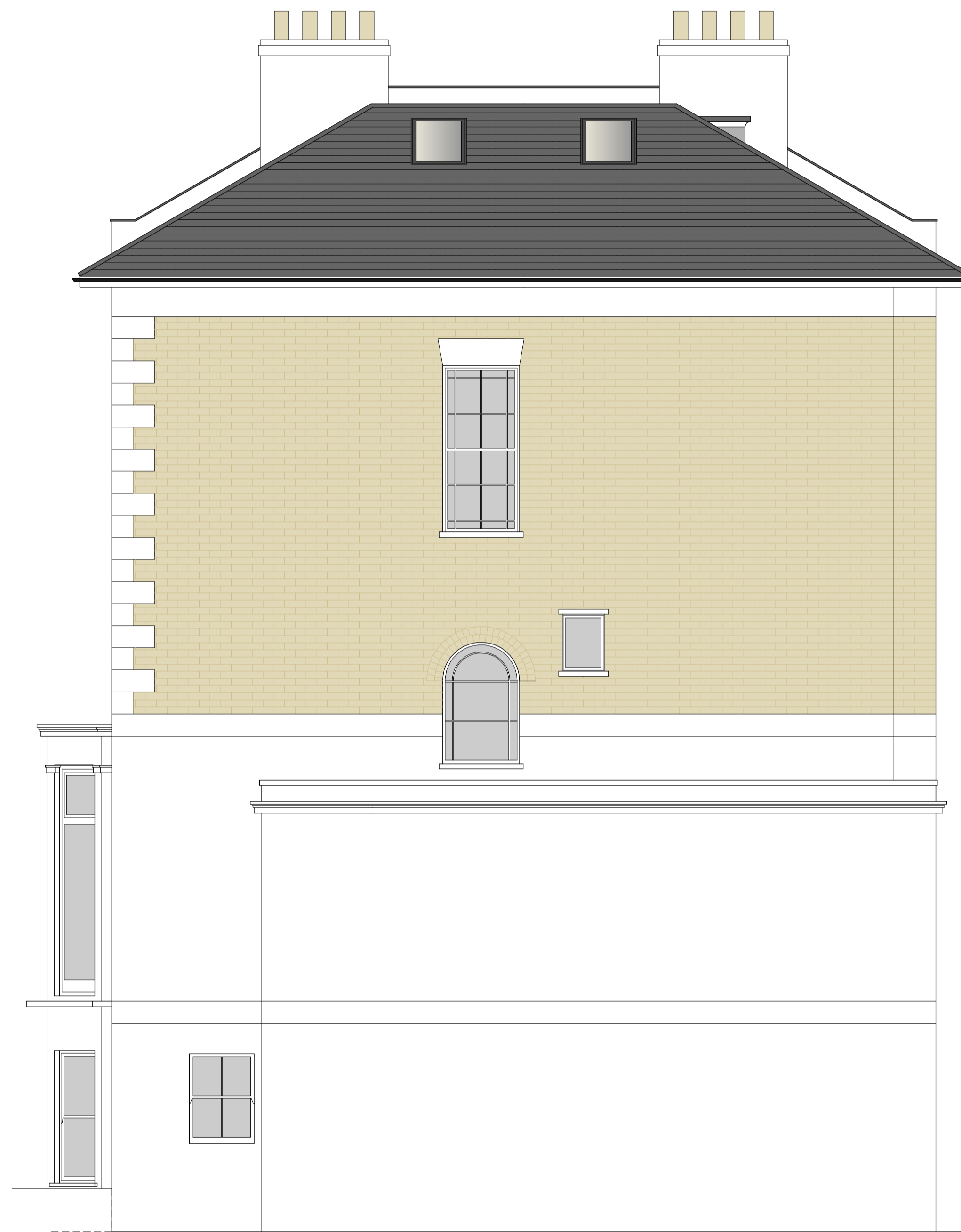
Proposed flank elevation