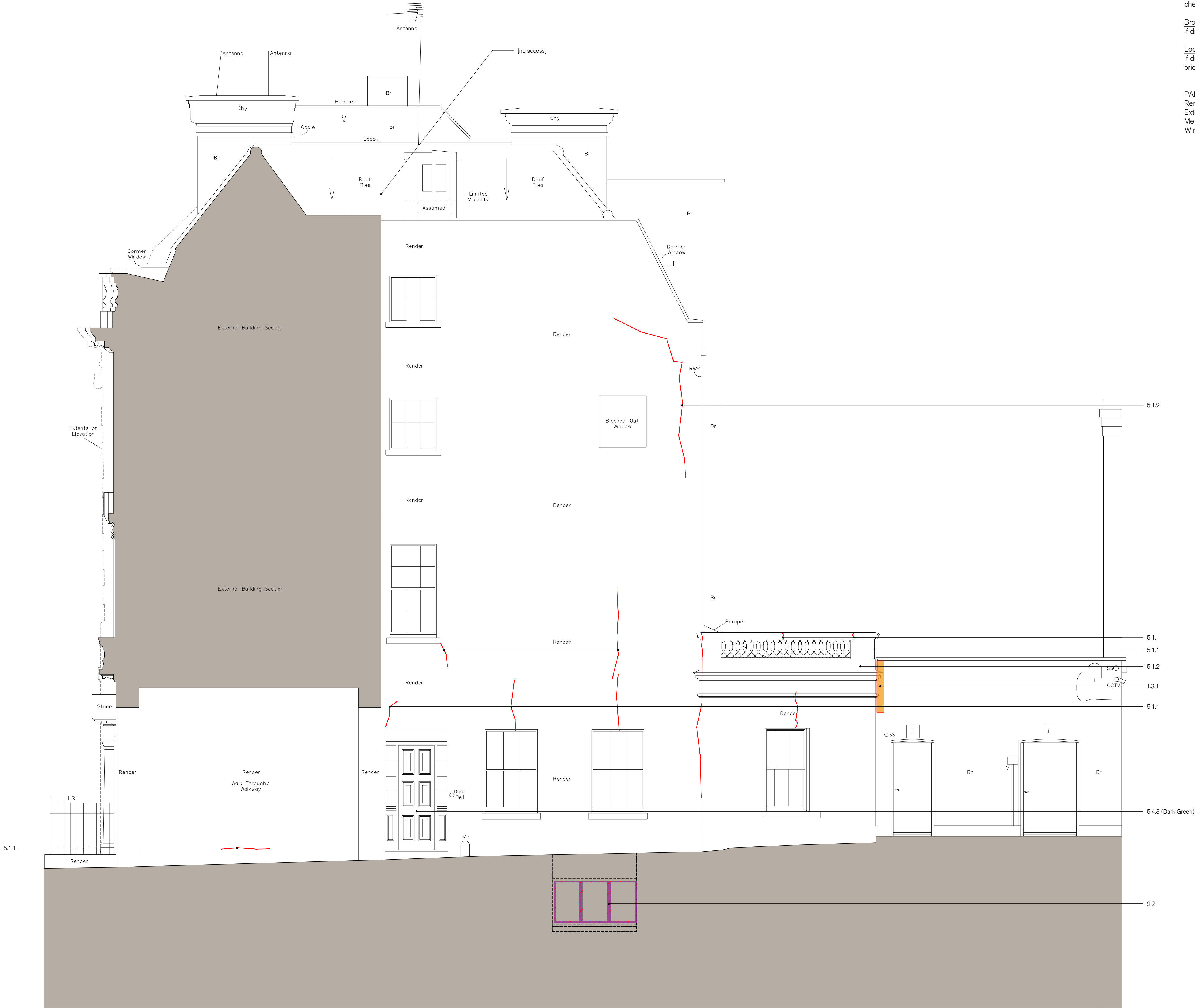
Elevation D 1:50