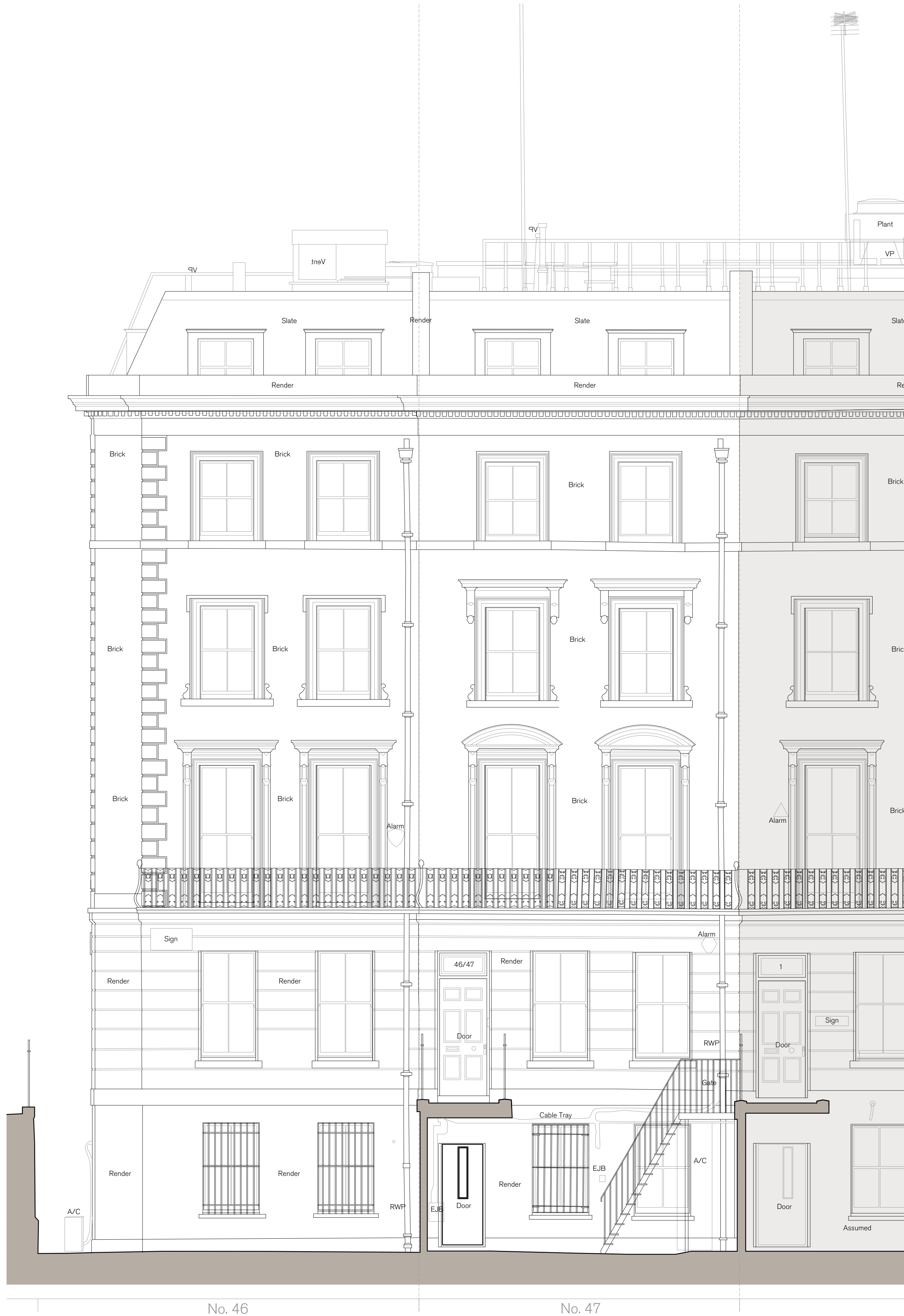
No. 46 Elevation G 1:50