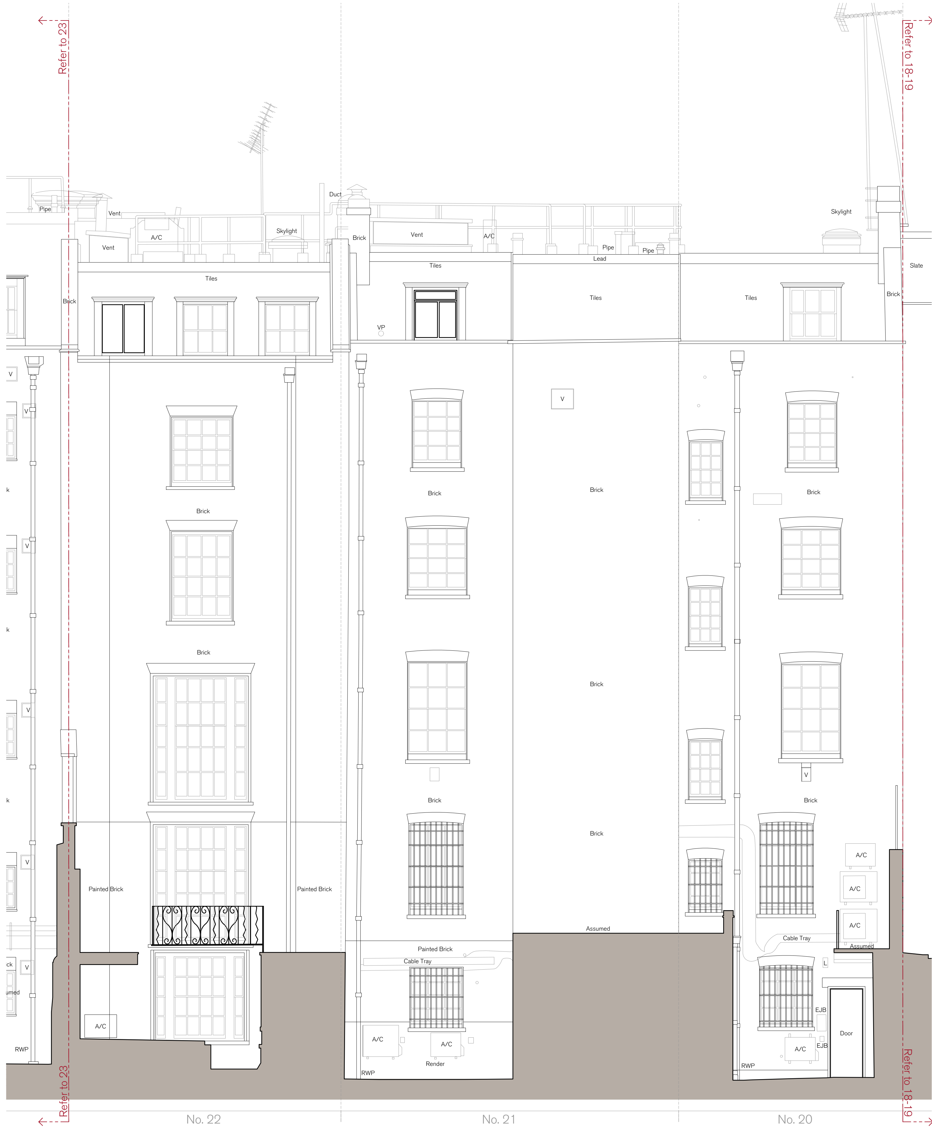
Elevation B 1:50